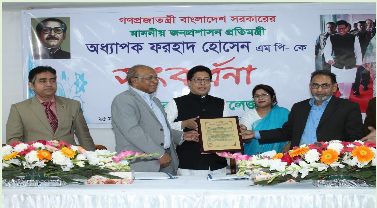
Honorable Minister of Public Administration and former Faculty of Dhaka City College is welcomed by Dhaka City College