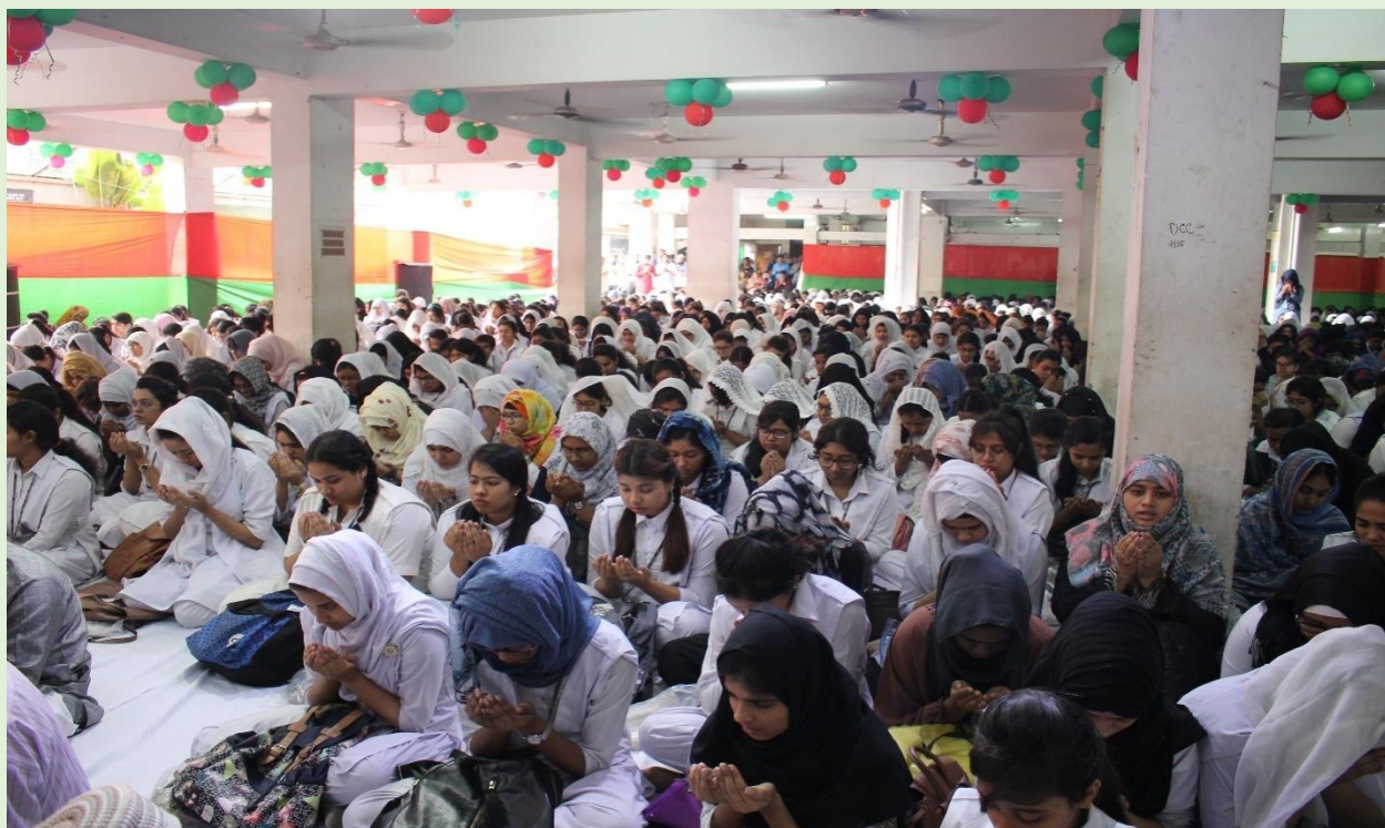
Students on the Milad Mahfil