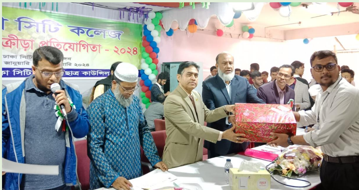
Principal and Vice-Principal giving away prizes to the indoor games competition winners