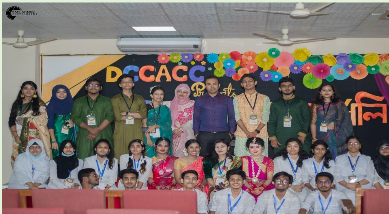
Participants along with faculty members on the program of Dhaka City College Arts and Crafts Club