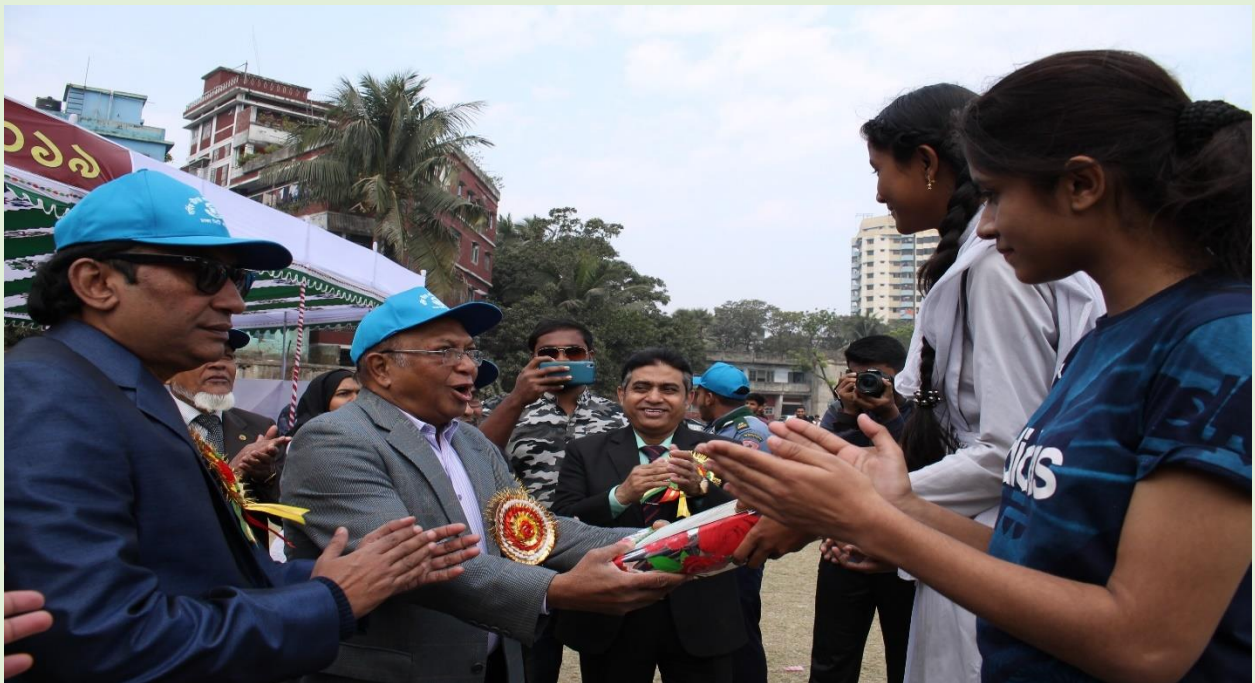
Presentation awarded to an event winner on outdoor games competition