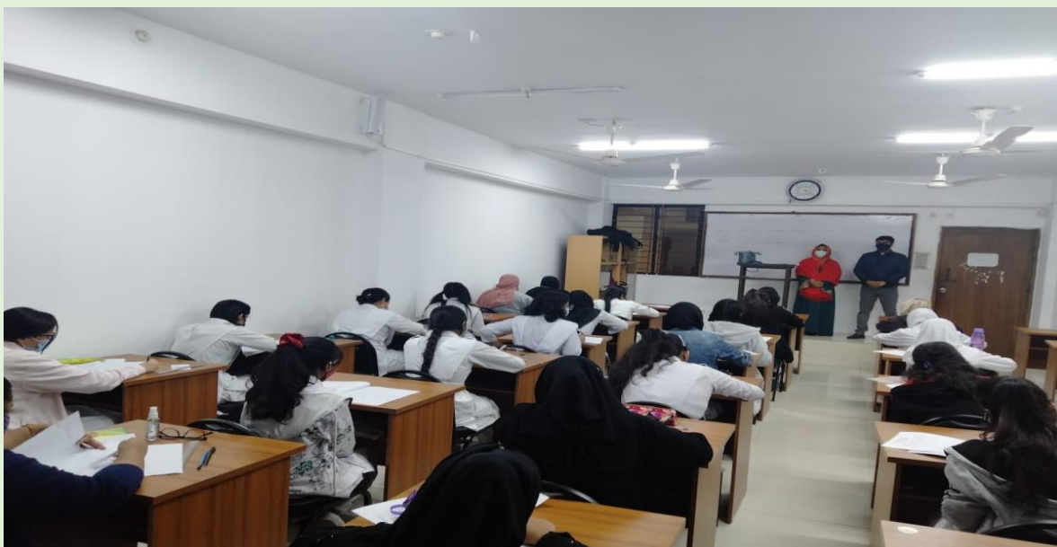
Students attending examination in a room refurbished under IDG project