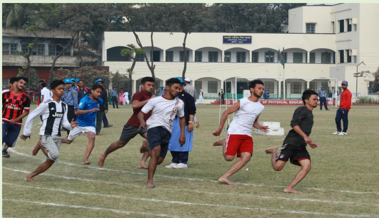
Participants on a sprint event of annual outdoor games competition