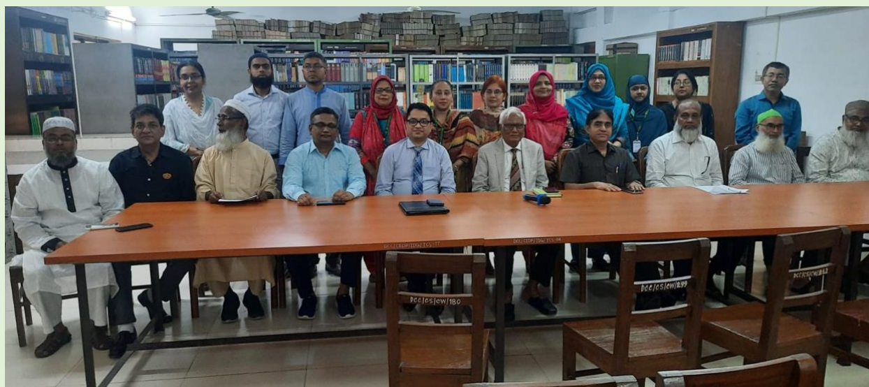
College Principal, Vice-Principal with External Peer External Review Committee members and participating teaching staff of Institutional Self Assessment