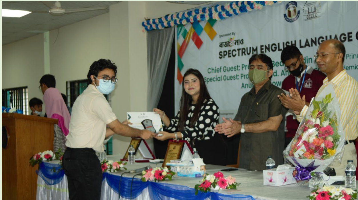
English Language Carnival arranged by Dhaka City College Language Club