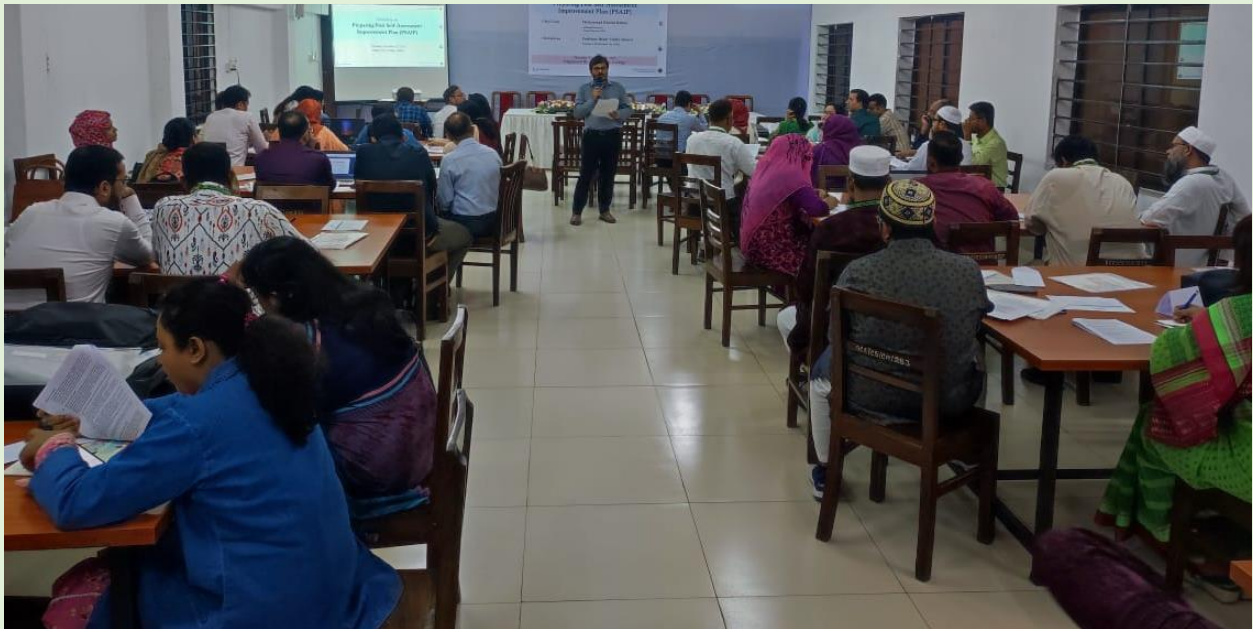
Participating teaching staff working on PSAIP workshop