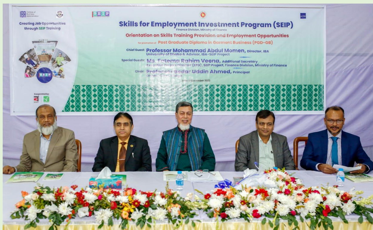
Faculties from IBA of Dhaka University, College Principal and Vice-Principal on a workshop organized by SEIP