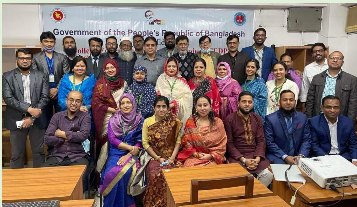
Participating teachers with the Principal on Inhouse Basic ICT Training