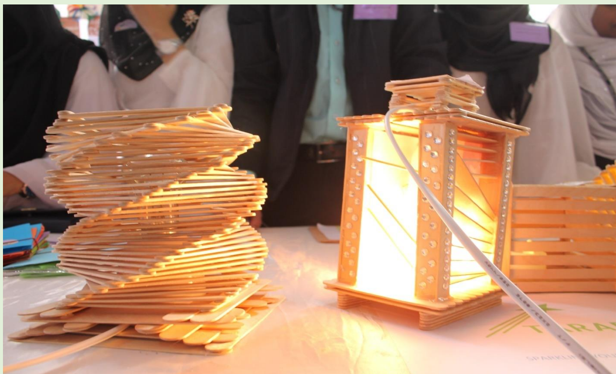
Products presented by students on new product development fest