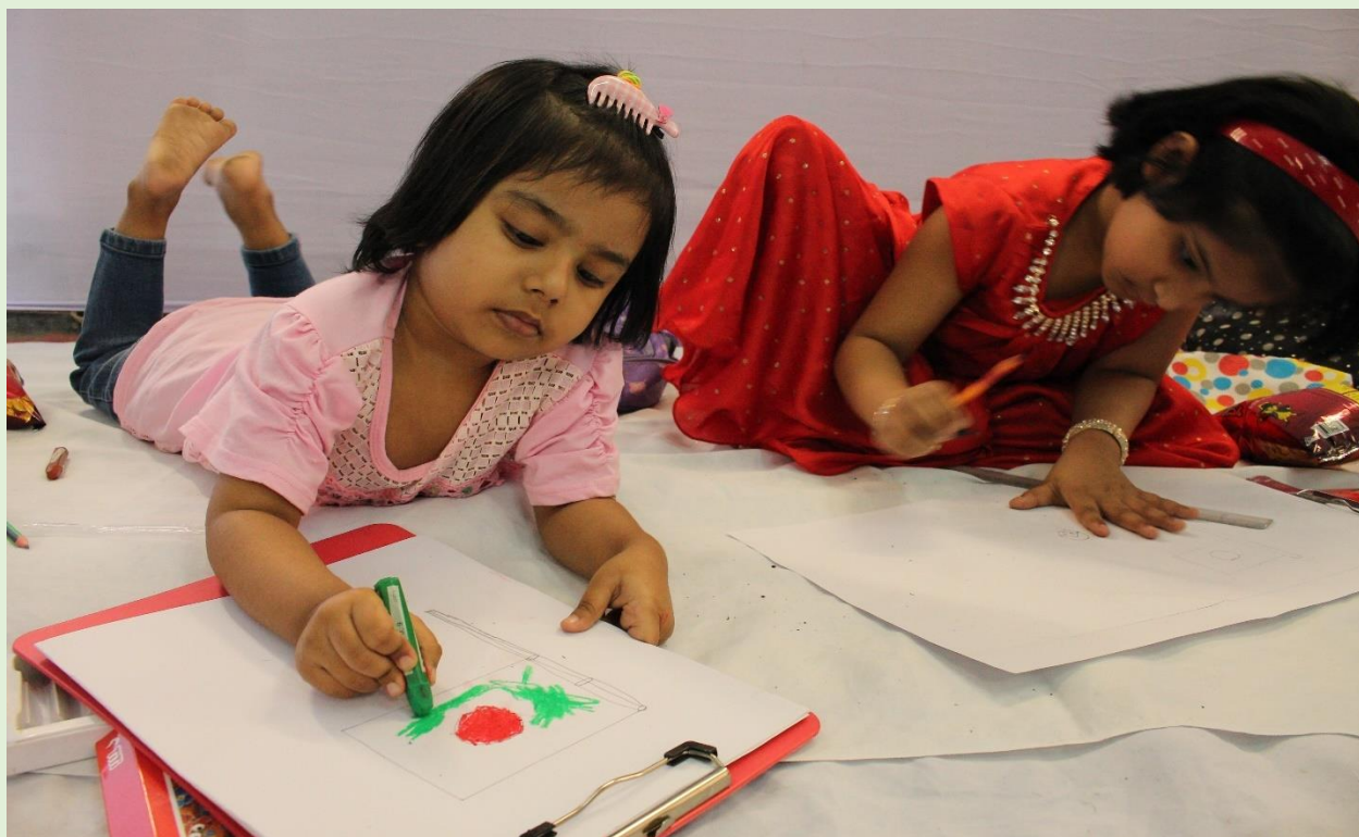
Kids participating on the drawing competition arranged on the occasion of National Children Day (the birth anniversary of the Father of the Nation Bangabondhu Sheikh Mujibur Rahman)