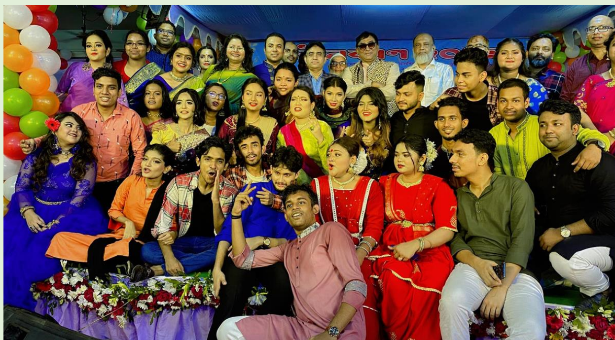
Performers with the guests, Principal, Vice-Principal and college teachers of the freshers' reception program