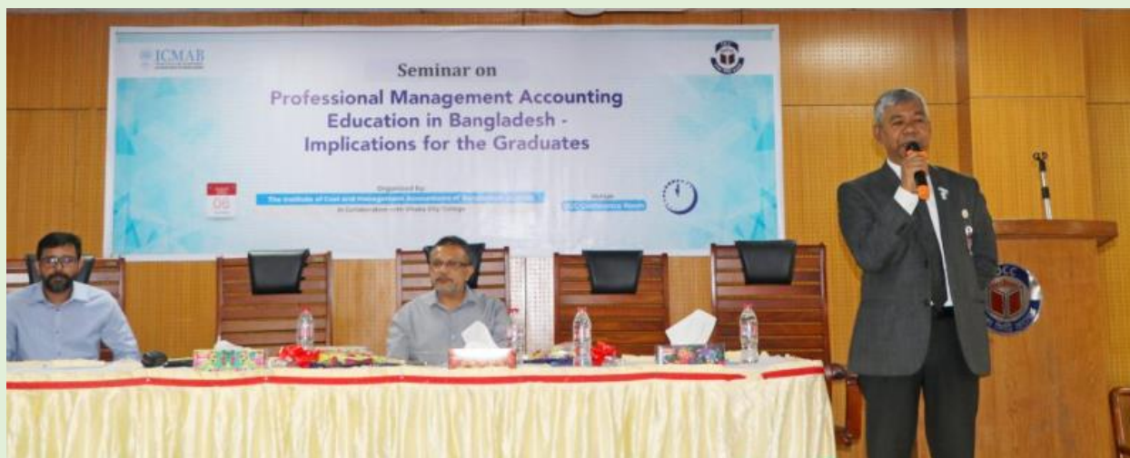
Speakers on a Seminar on Professional Management Accounting Education in Bangladesh.