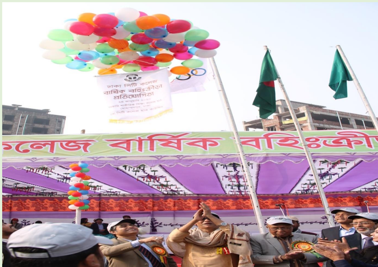
Annual Outdoor Sports

Students of BBA participating in new product development competition