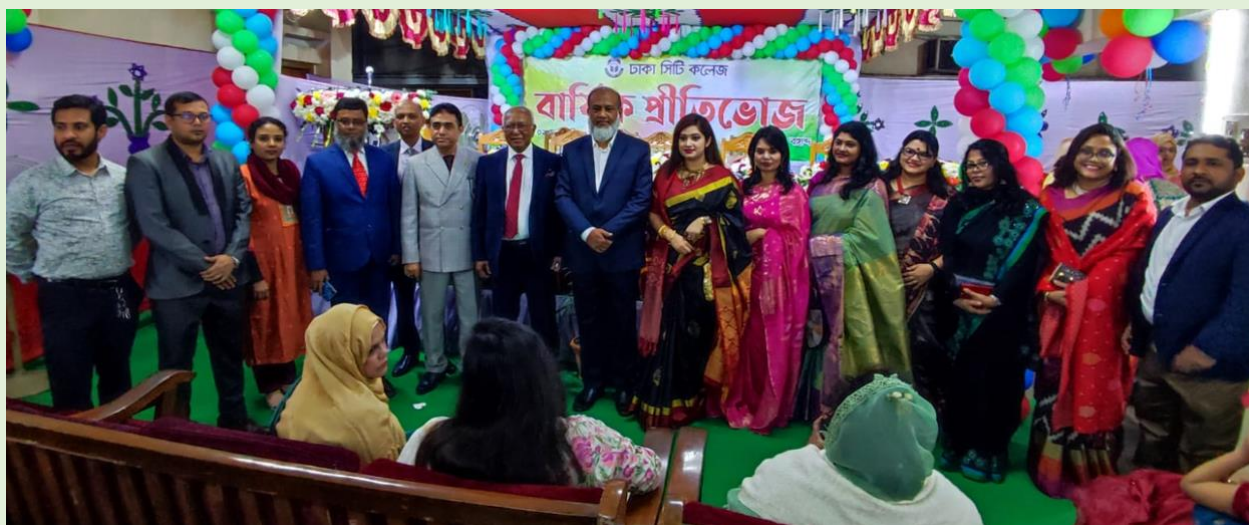
Teachers with the Chairman of Dhaka City College governing body, Principal and Vice-principal