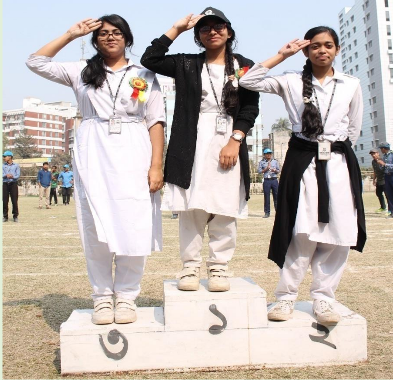
Salute from an event winners of outdoor games competition