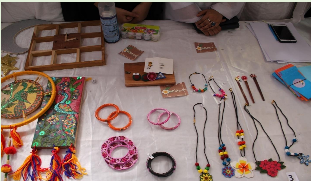
Products introduced by students on new product development fest