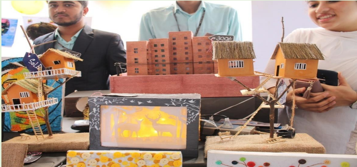
New Product Development Competition

Students of BBA participating in new product development competition