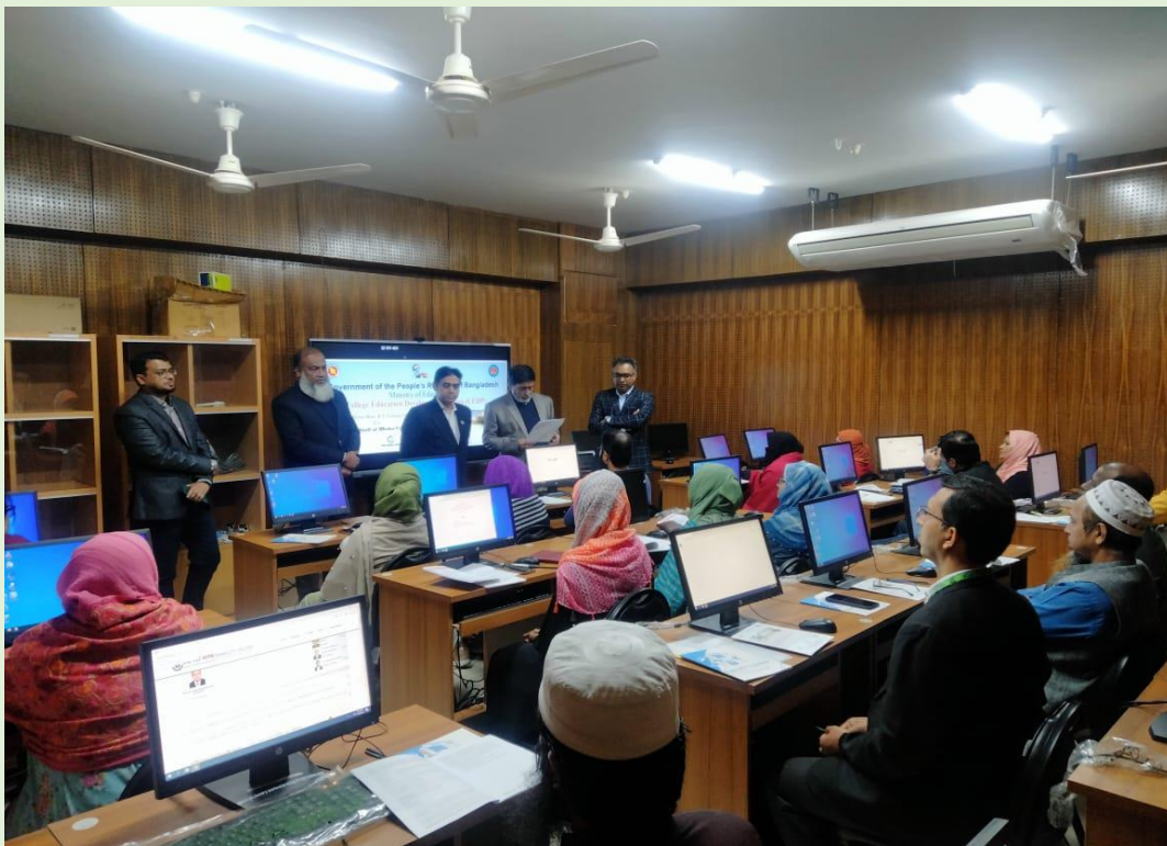
A part of Faculties and Staff on Basic ICT Training