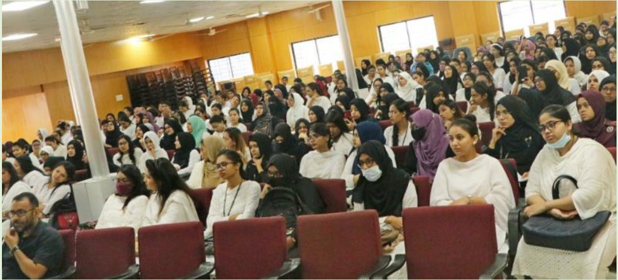
Participating students of Seminar on Professional Management Accounting Education in Bangladesh.