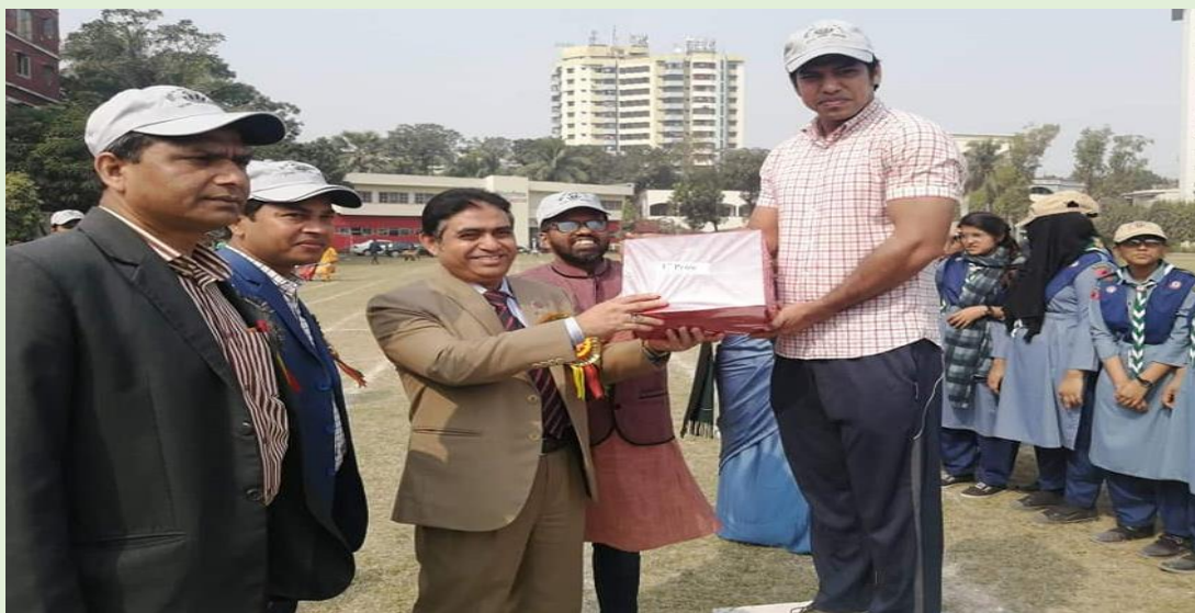
Prize awarded to the winner of annual outdoor games competition by the Principal