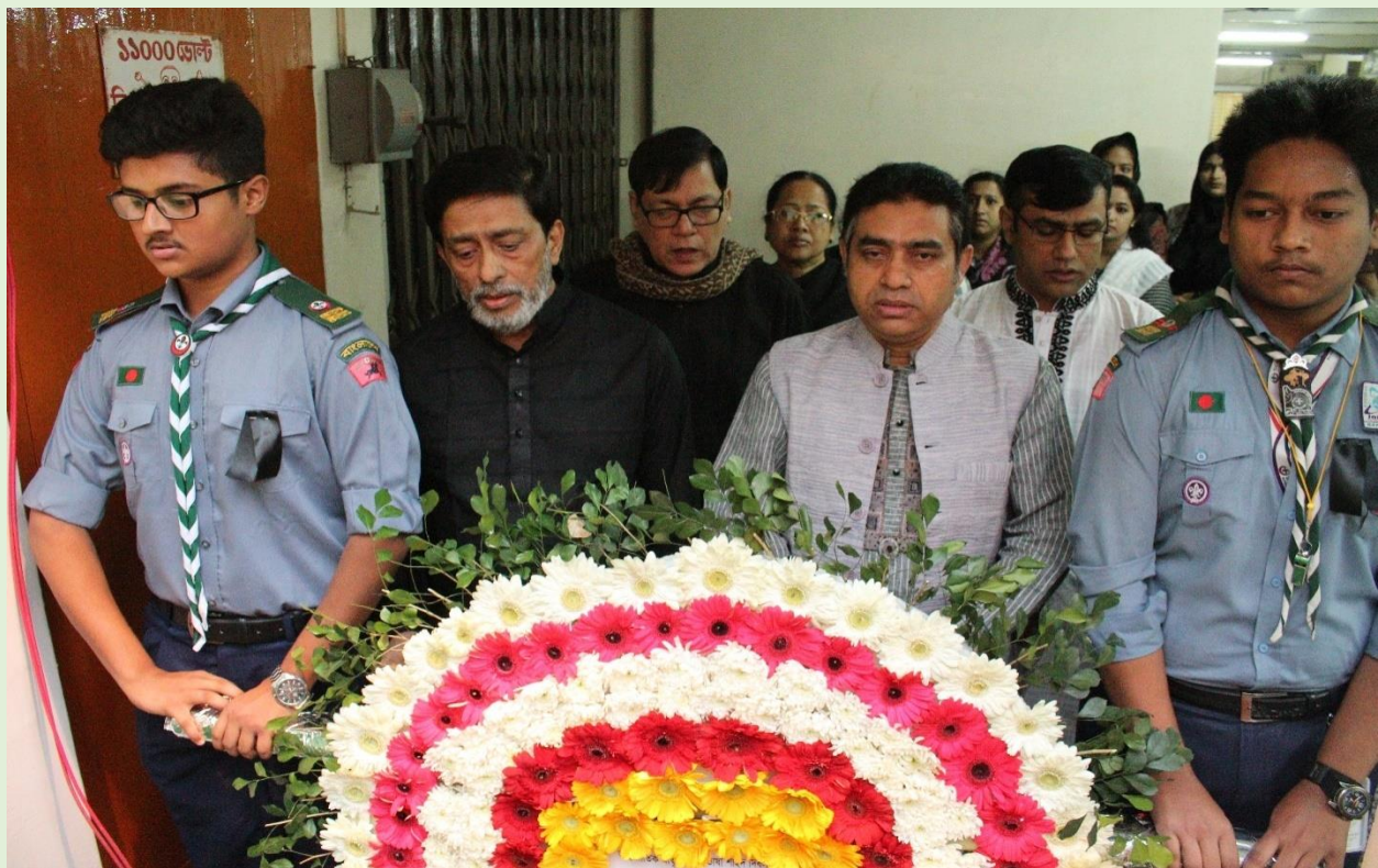
Paying tributes to the language martyrs