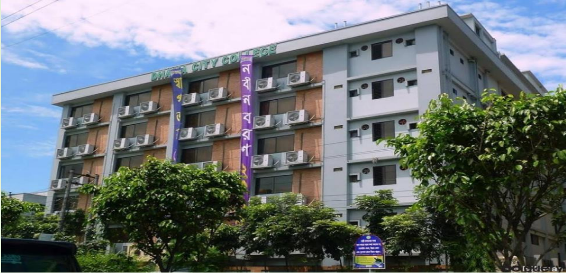
Main College Building at Dhanmondi#02