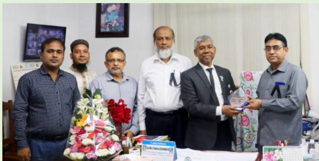
Guests from ICMAB are welcomed by the Principal and Vice-Principal