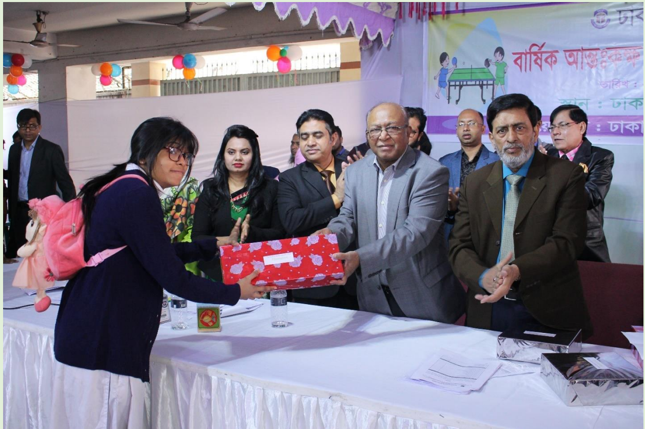
Honorable Chairman of the Dhaka City College governing body handing over the presentation on Annual Indoor Games Competition