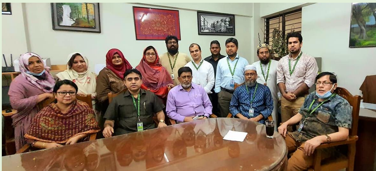
Teachers with Principal and Vice-Principal