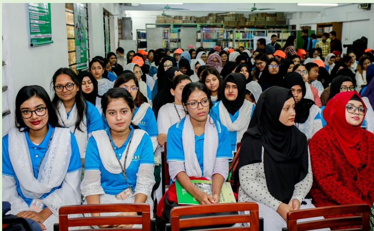
Participating students of SEIP workshop on enhancing employability