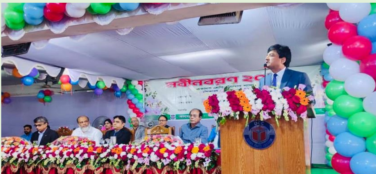
Honourable Vice Chancellor of National University Delivering speech on Freshers Reception of Dhaka City College- 2023