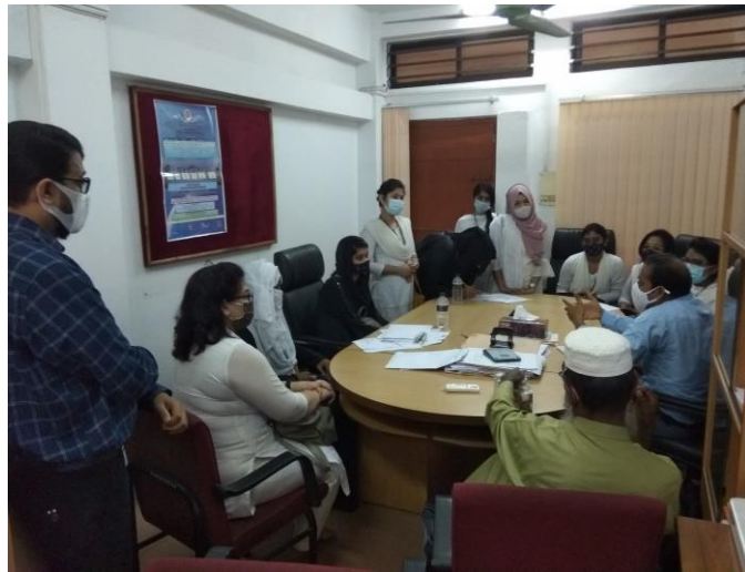
Figure 5: Picture of the public consultation meeting on September 23, 2021