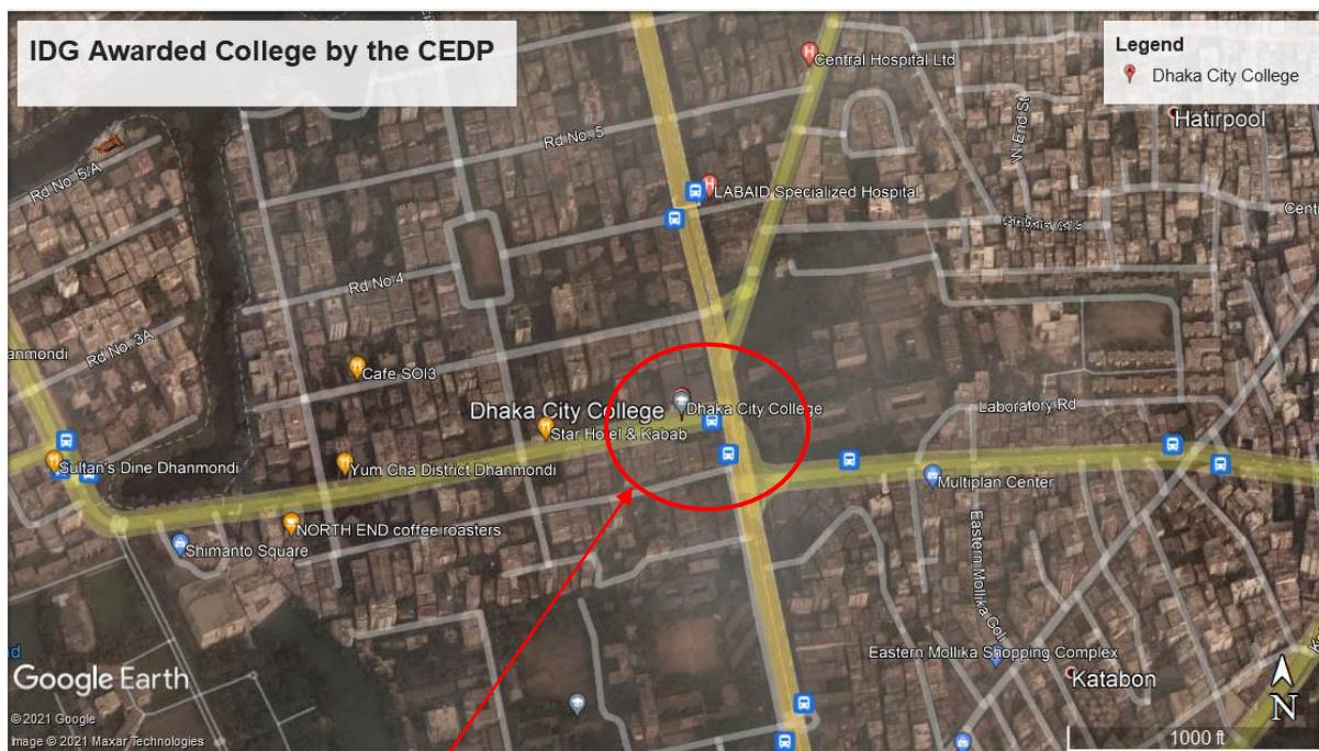
Figure 2: Dhaka City College, Dhaka in Google Map