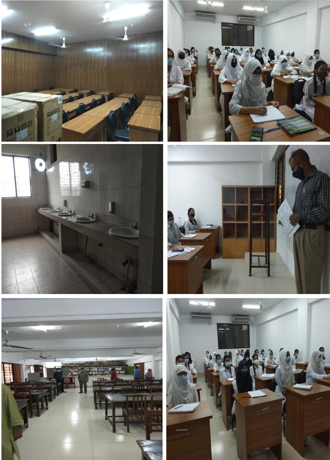
Figure 3: Photographs of the proposed schemes

10. The tentative environmental and social impacts by the sub-projects;