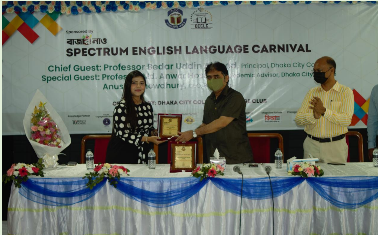
Principal and invited guests on Spectrum English Language Carnival arranged by Dhaka City College Language Club