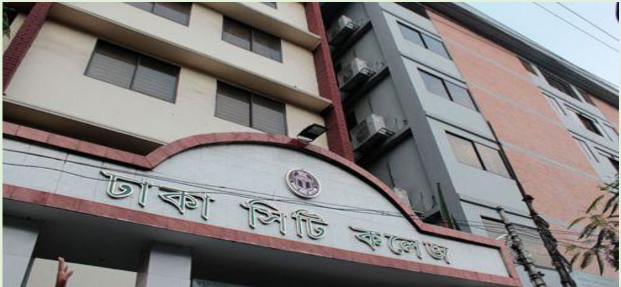
Dhaka City College Building