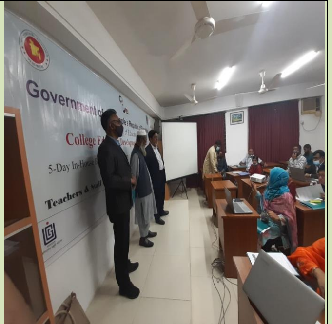
In-house training of teachers and staffs on Basic ICT