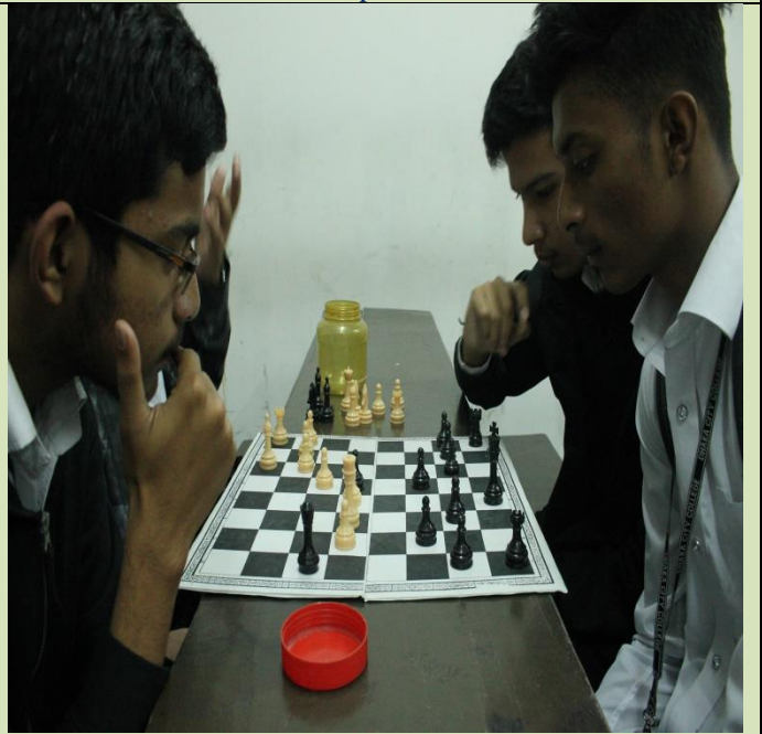
Students participating in Indoor Games Competition