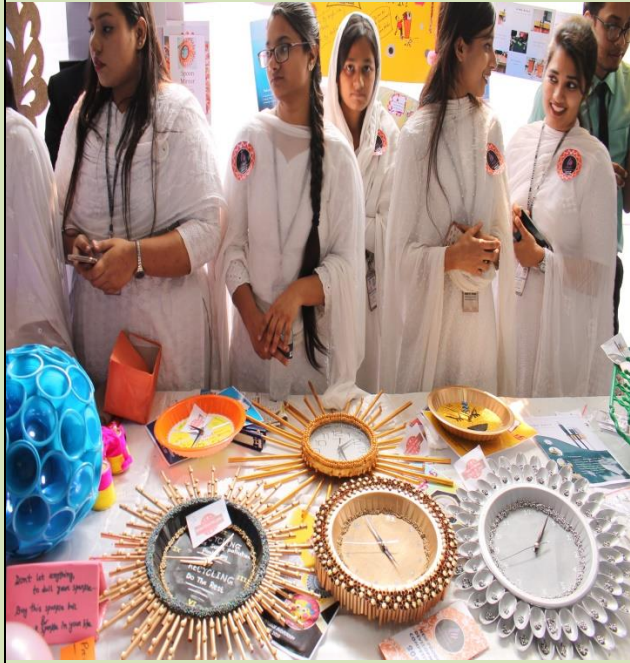
Students Participating in New Product Development Competition