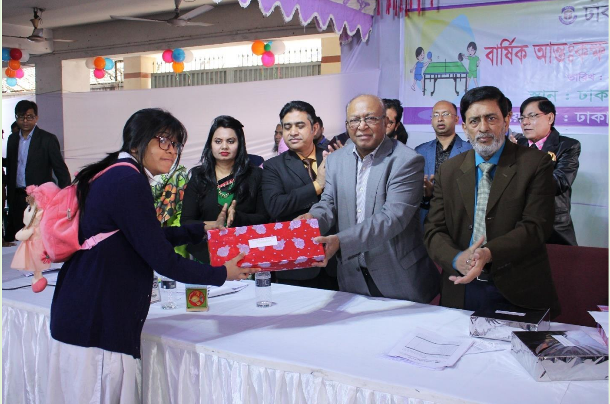
Honorable Chairman of the Dhaka City College governing body handing over the presentation on Annual Indoor Games Competition