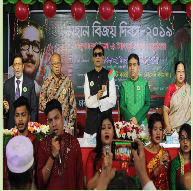
Celebrating Victory Day