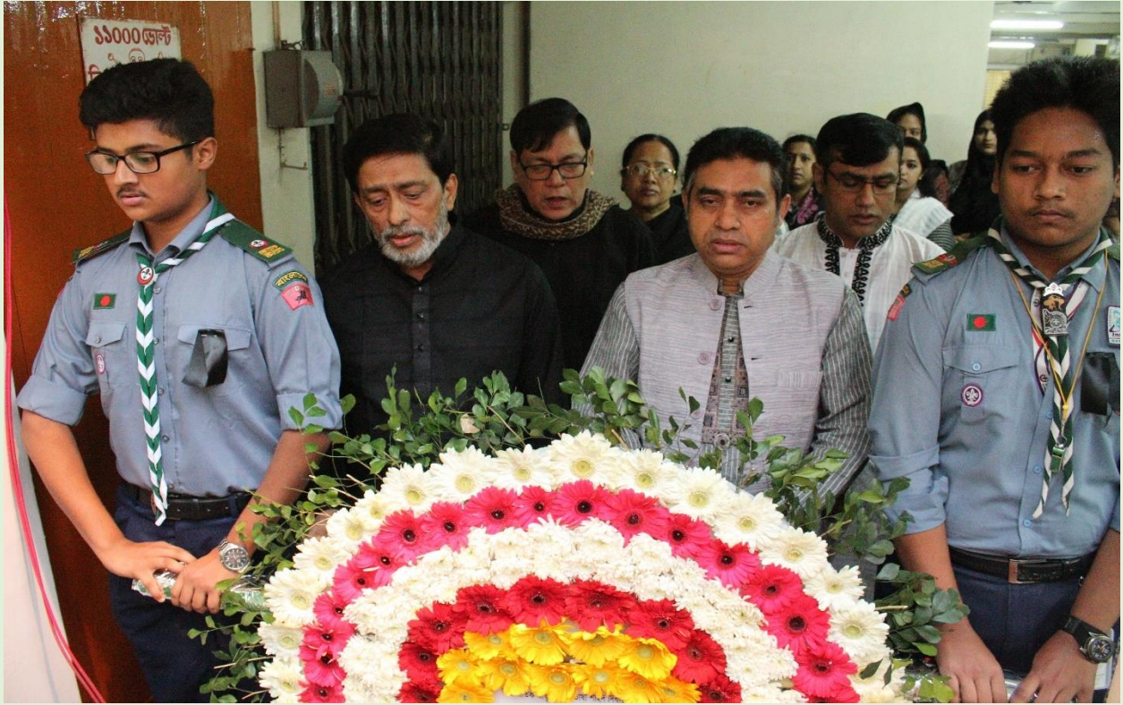
Paying tributes to the language martyrs