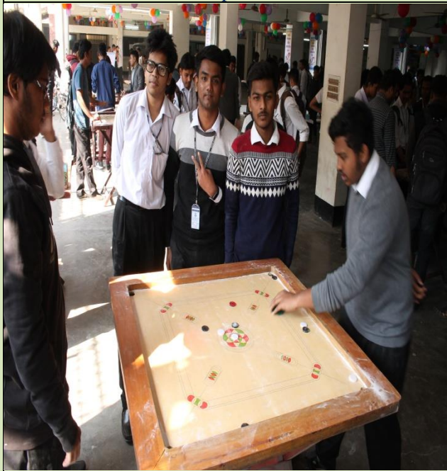
Students participating in Indoor Games Competition