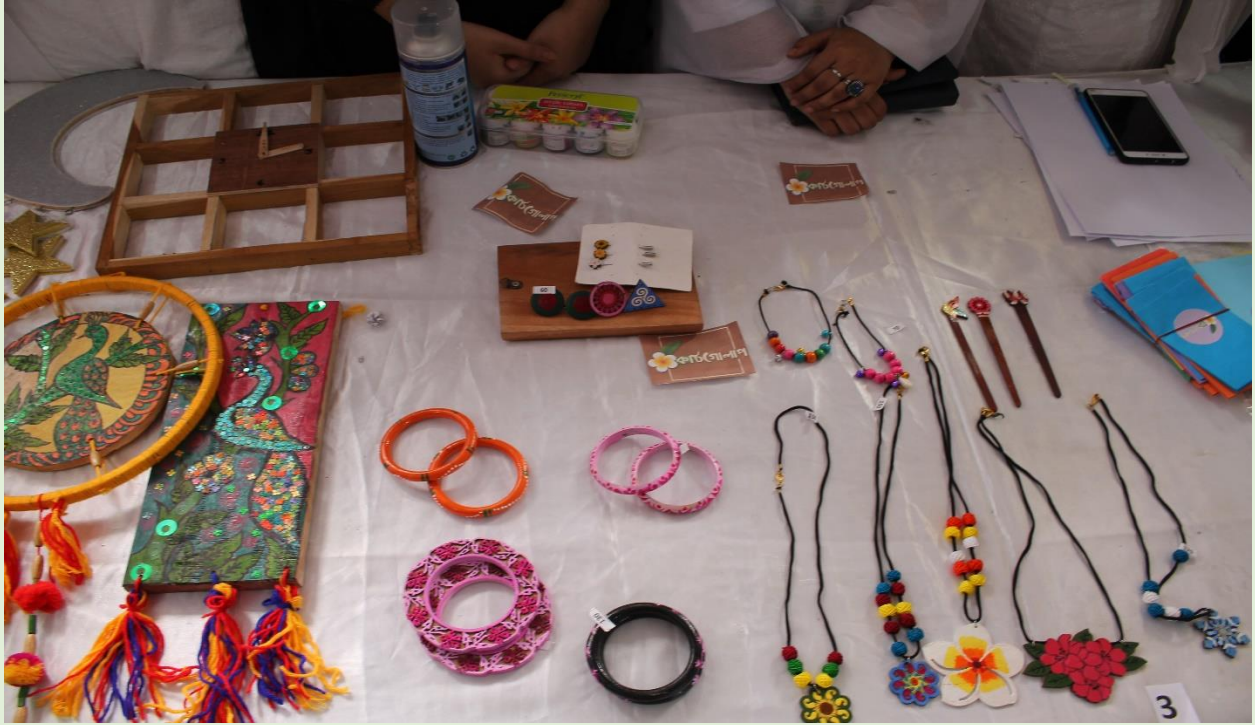
Products introduced by students on new product development fest