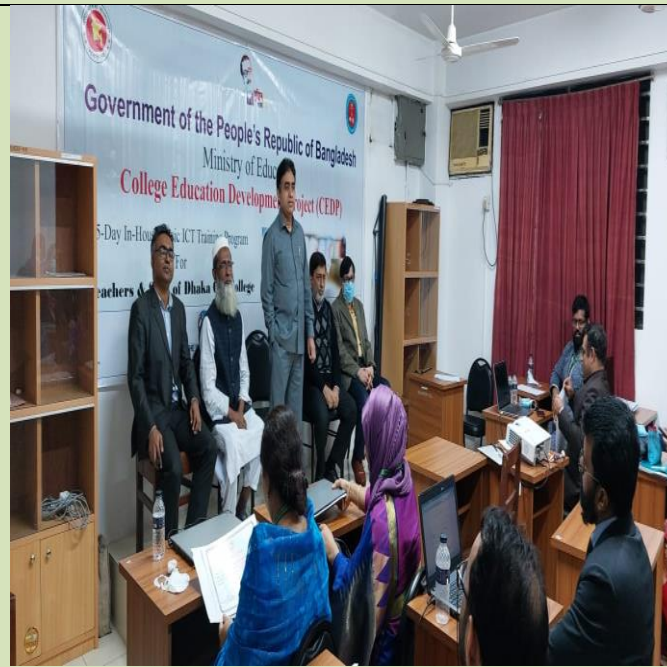
In-house training of teachers and staffs on Basic ICT