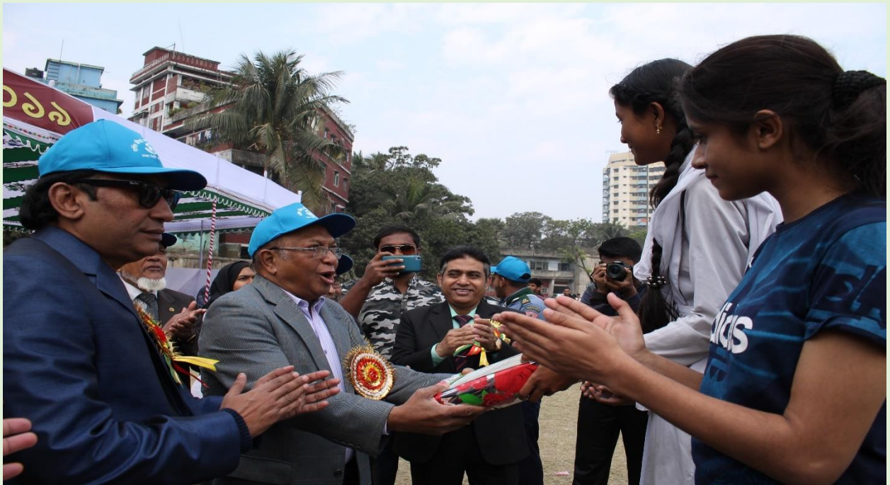
Presentation awarded to an event winner on outdoor games competition