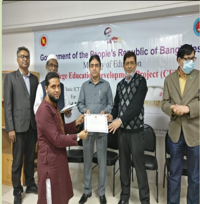
In-house training of teachers and staffs on Basic ICT