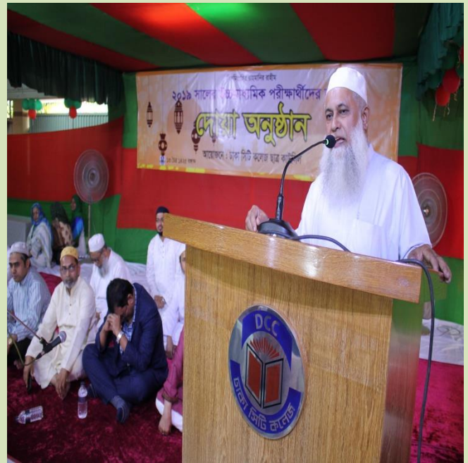
Prayer program for students