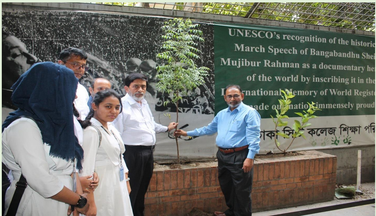
Tree Plantation in College Premises