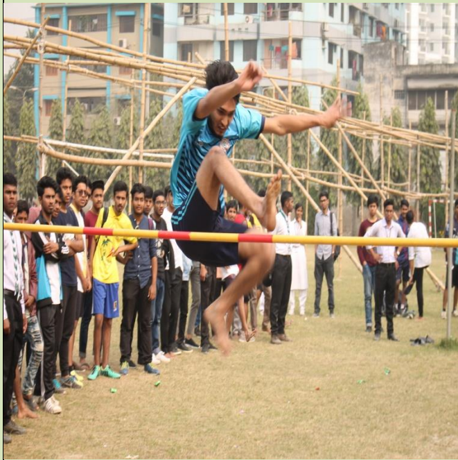
Students participating in outdoor Games Competition