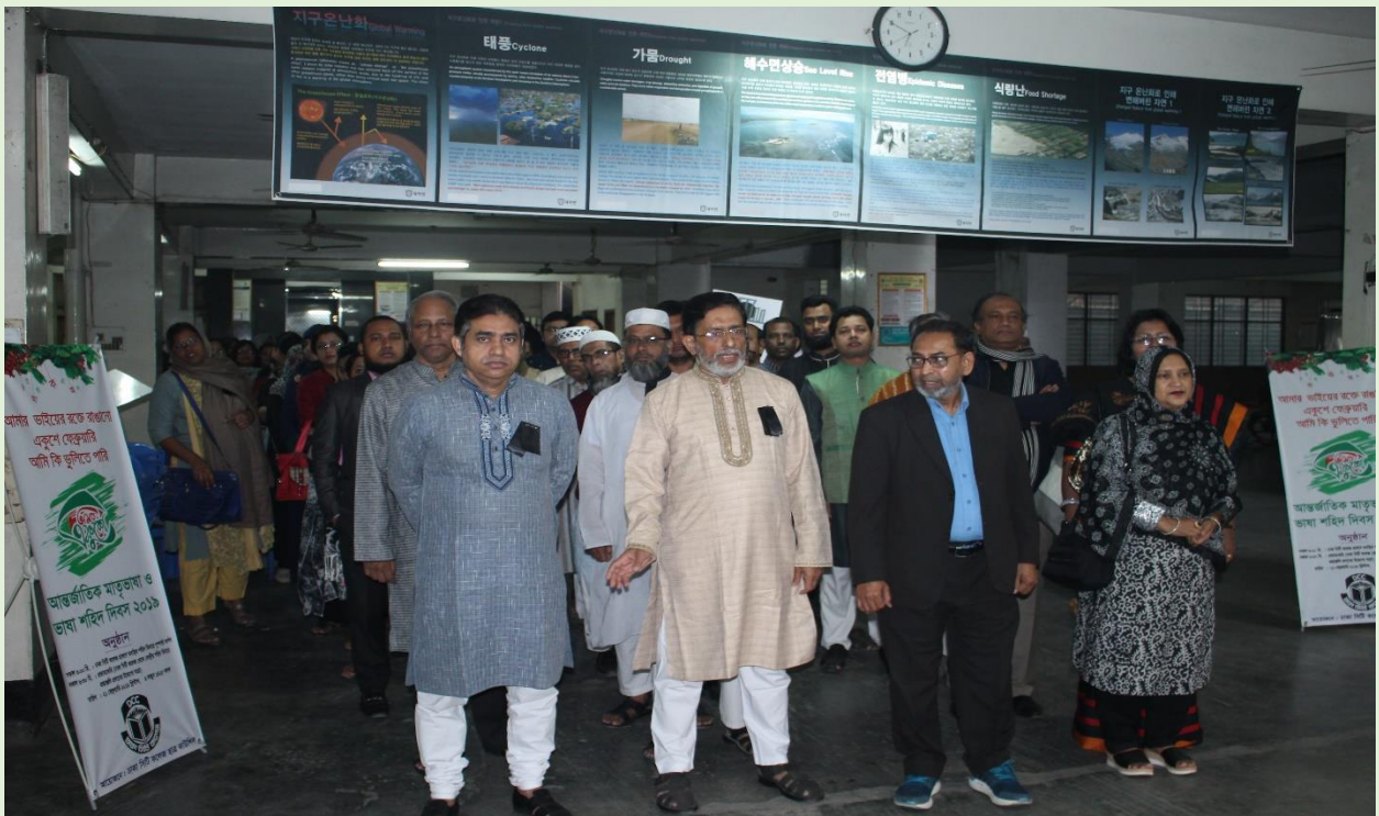
Commemorating International Mother Language Day and National Martyrs' Day