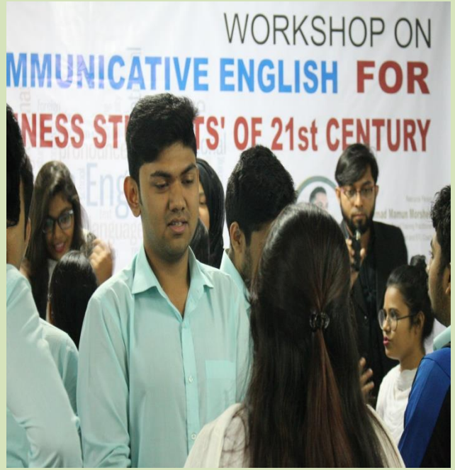
Students participating in Communication Language Competition