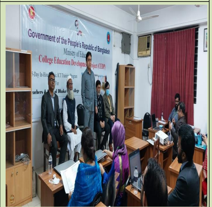
In-house training of teachers and staffs on Basic ICT