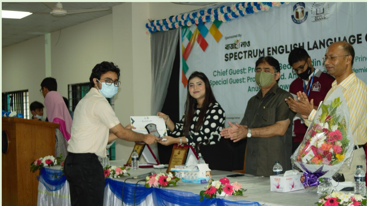
English Language Carnival arranged by Dhaka City College Language Club