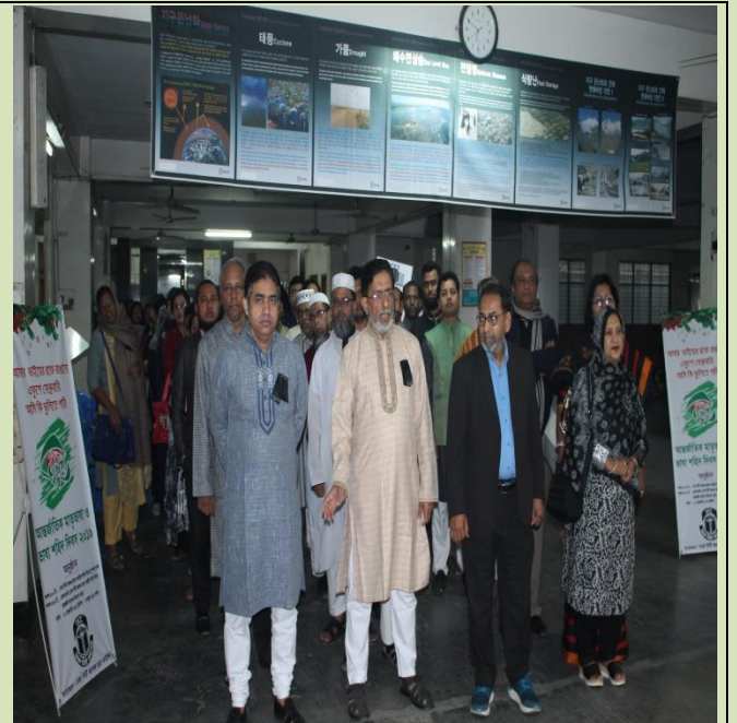
Commemoration of National Martyr day