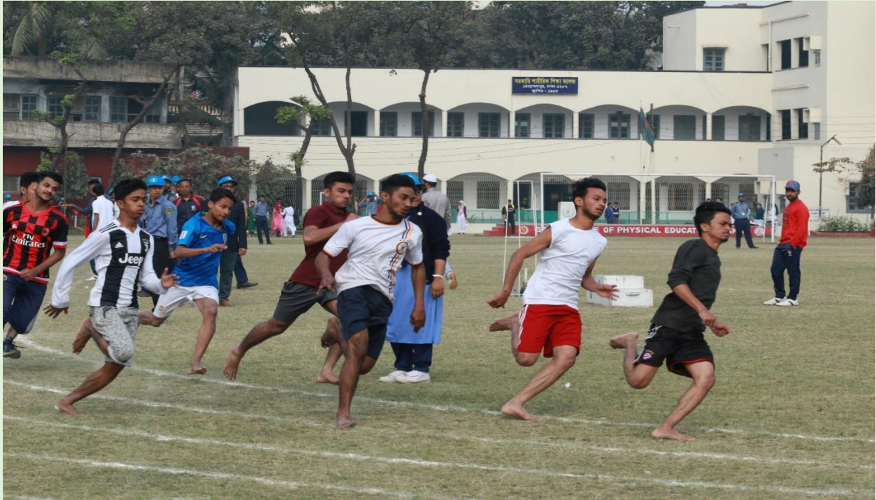
Participants on a sprint event of annual outdoor games competition