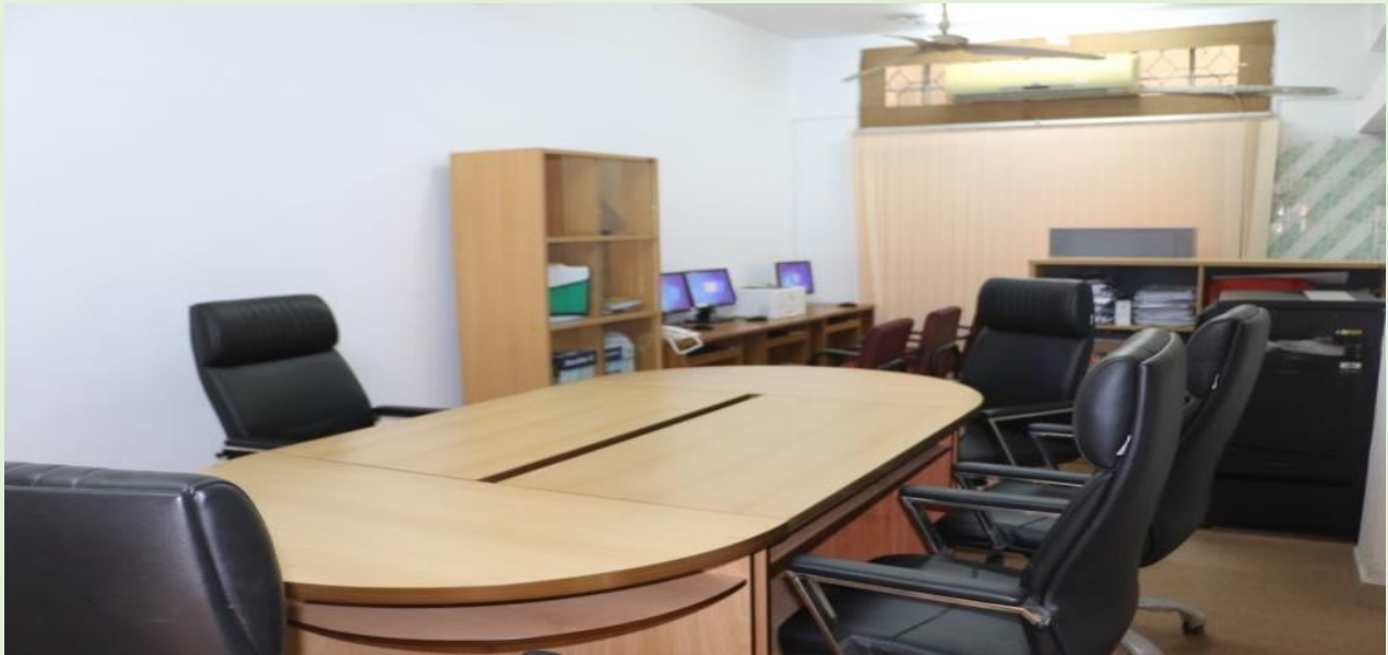
CEDP IDG Program Office of Dhaka City College