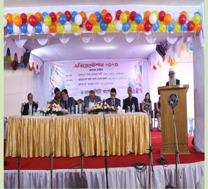
Students Orientation Program