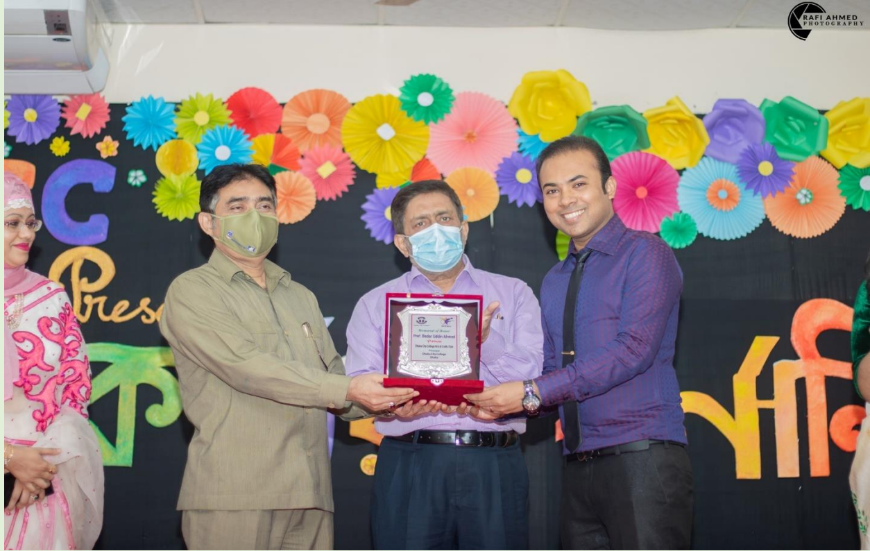
Principal is being received on the annual Dhaka City College Arts and Crafts Club