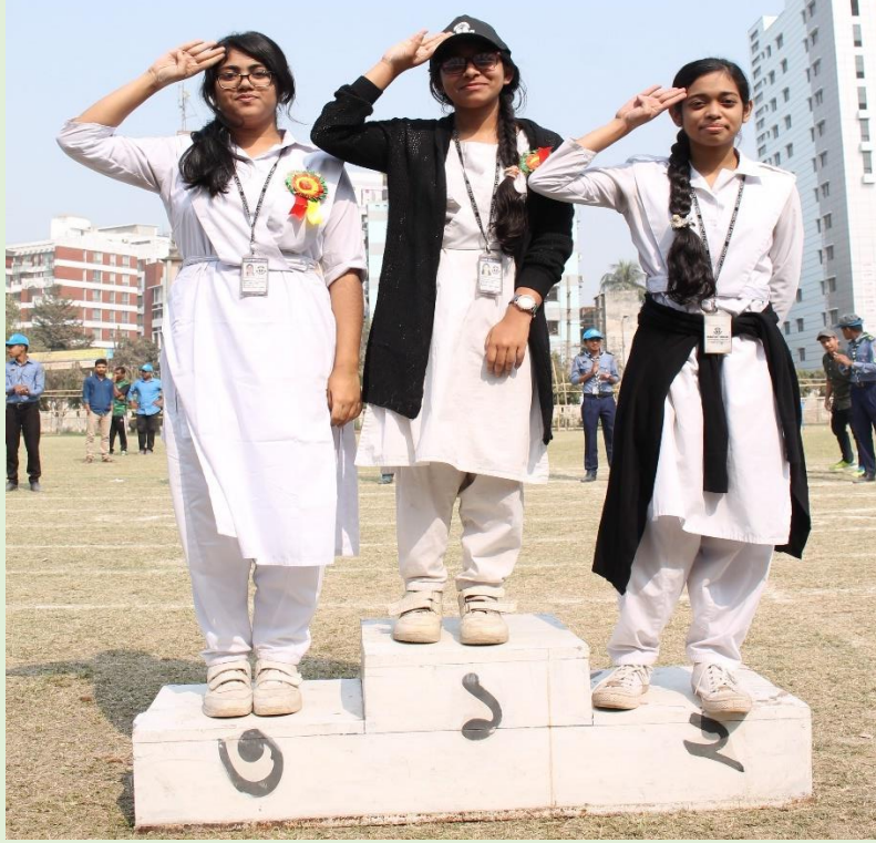
Salute from an event winners of outdoor games competition