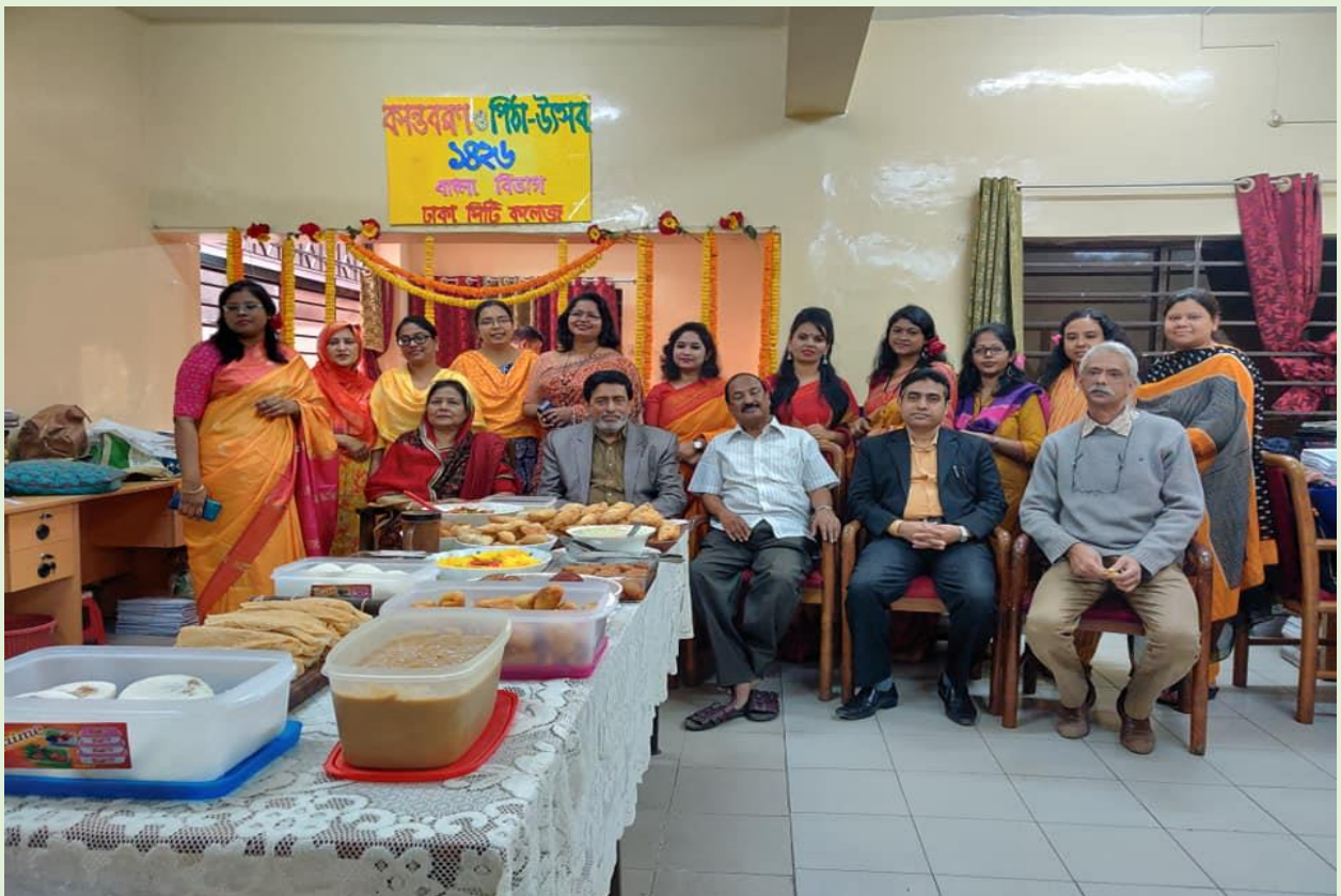
Faculties on Pitha Festival