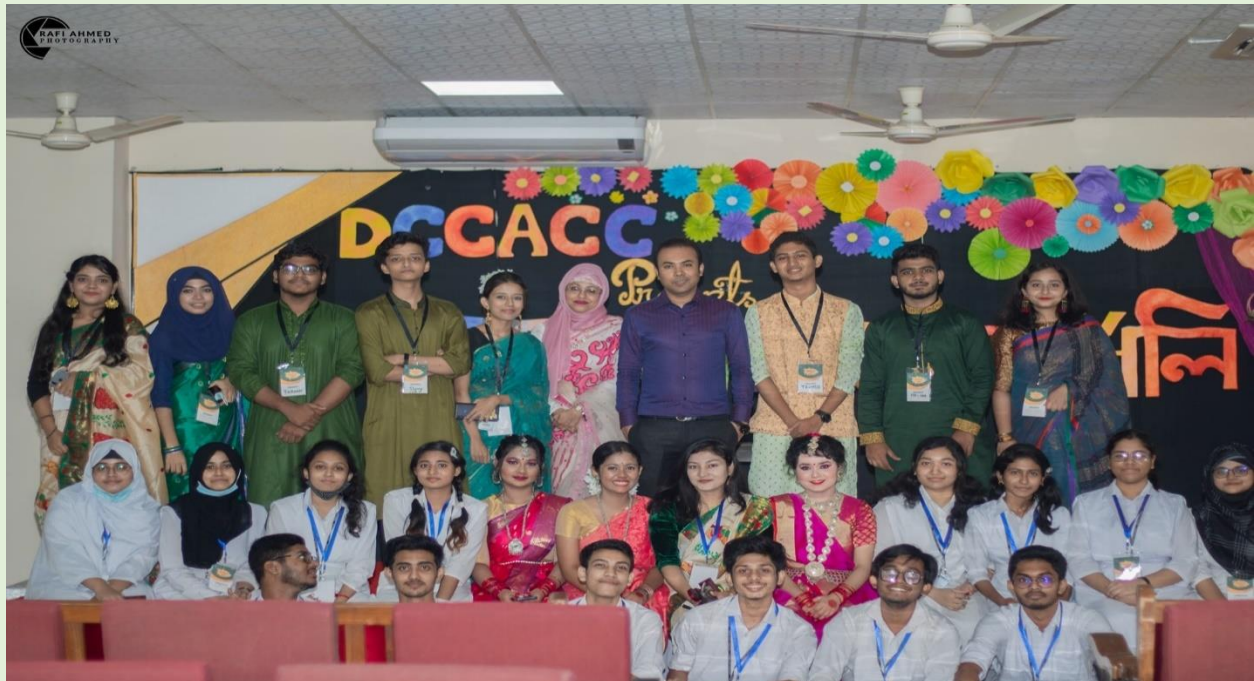
Participants along with faculty members on the program of Dhaka City College Arts and Crafts Club