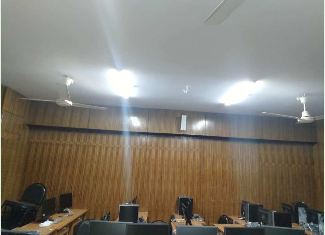
Multifunctional ICT cum Language Laboratory financed by IDG