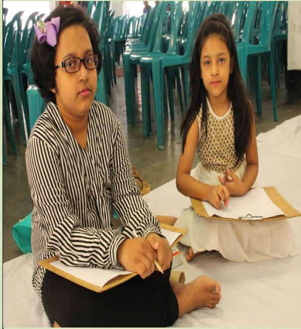
Participants on National Children Day