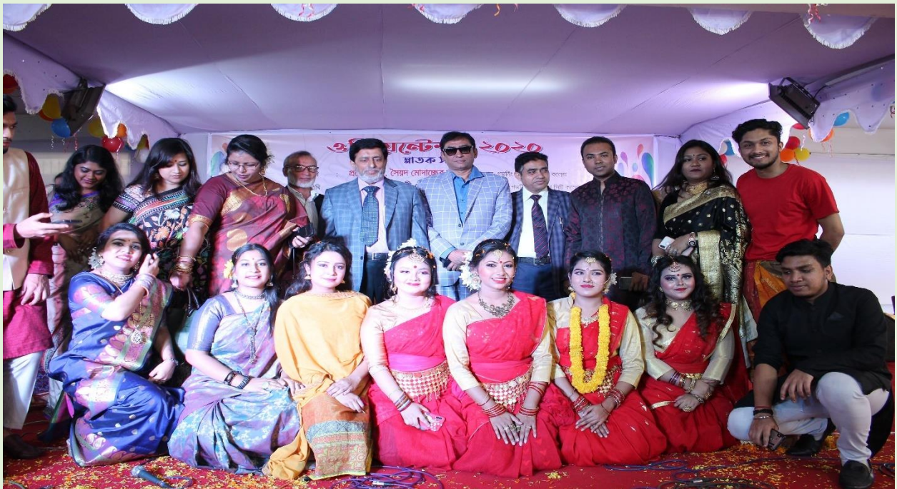
Performers of orientation program with the Principal and other faculties