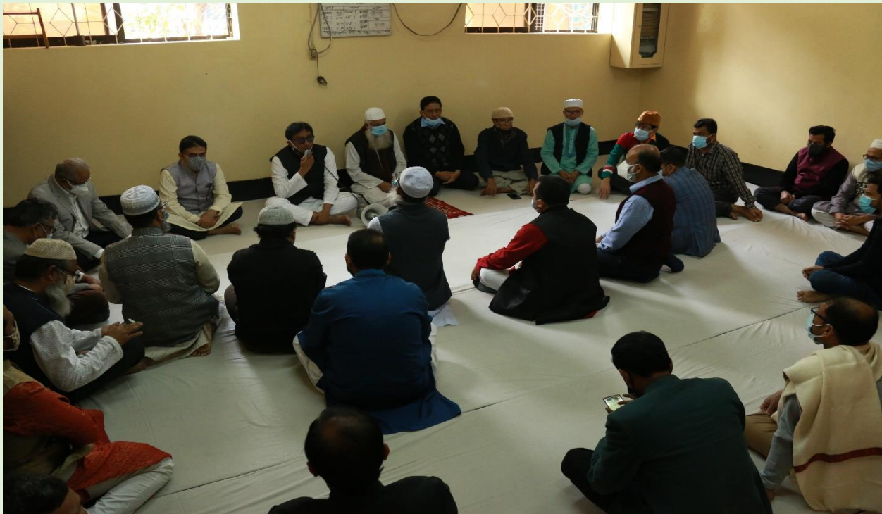
Few of the Faculty Members on the Dua Mahfil program of Victory Day, 2021