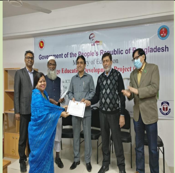
In-house training of teachers and staffs on Basic ICT