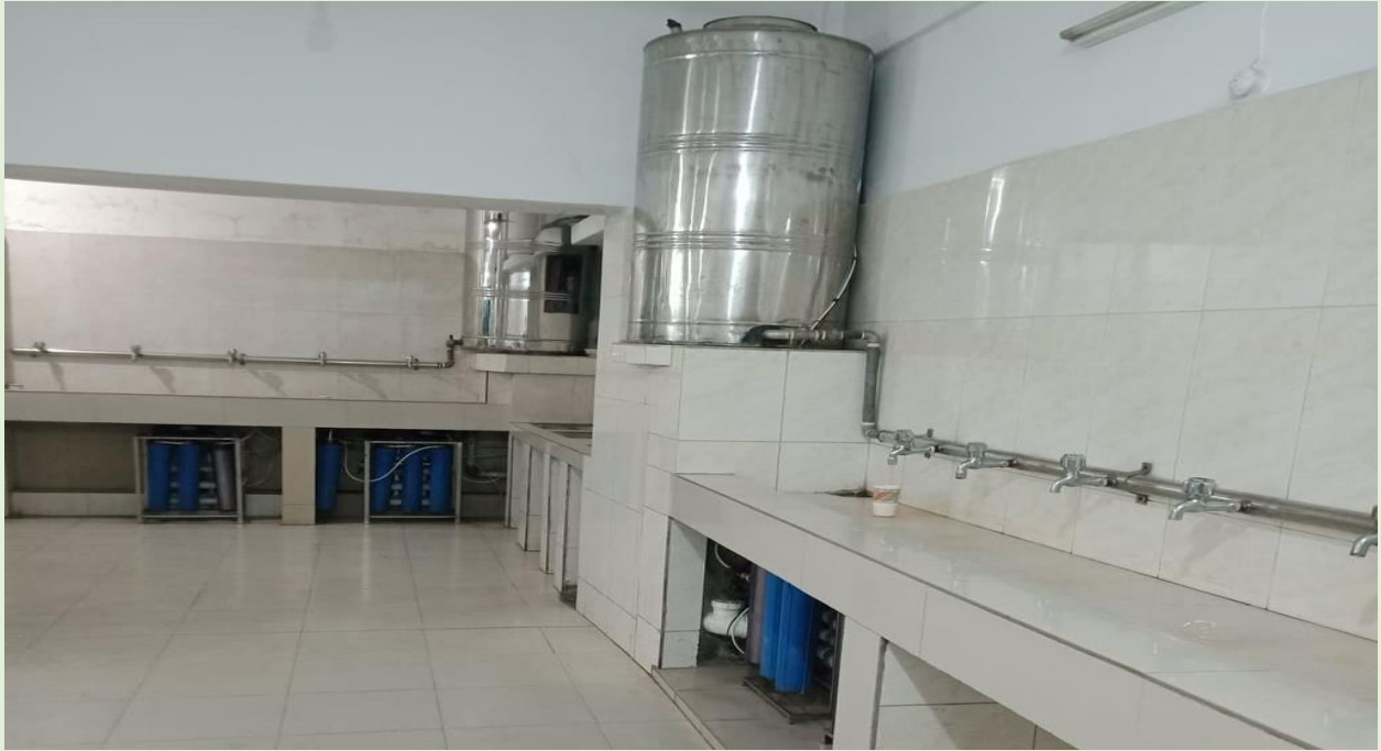
Water treatment plant