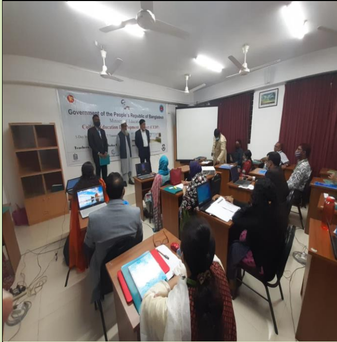
In-house training of teachers and staffs on Basic ICT