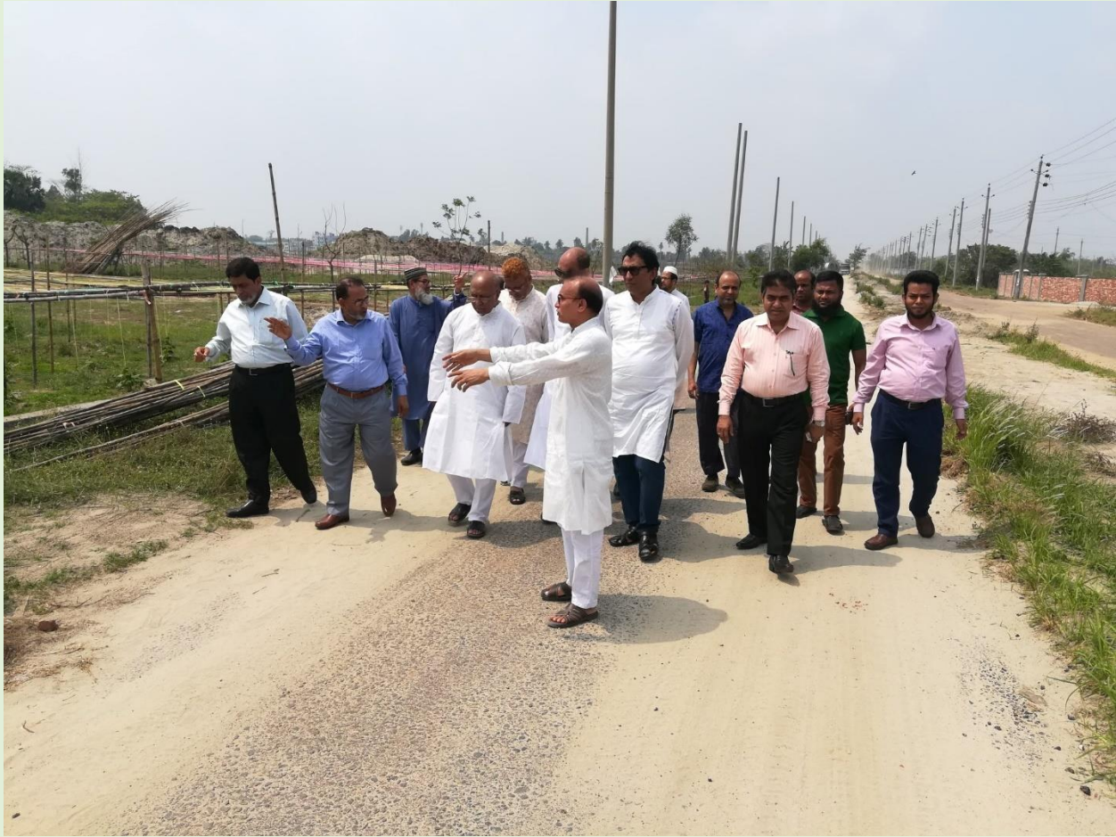
College Authority on a visit to its premises in Purbachal Area