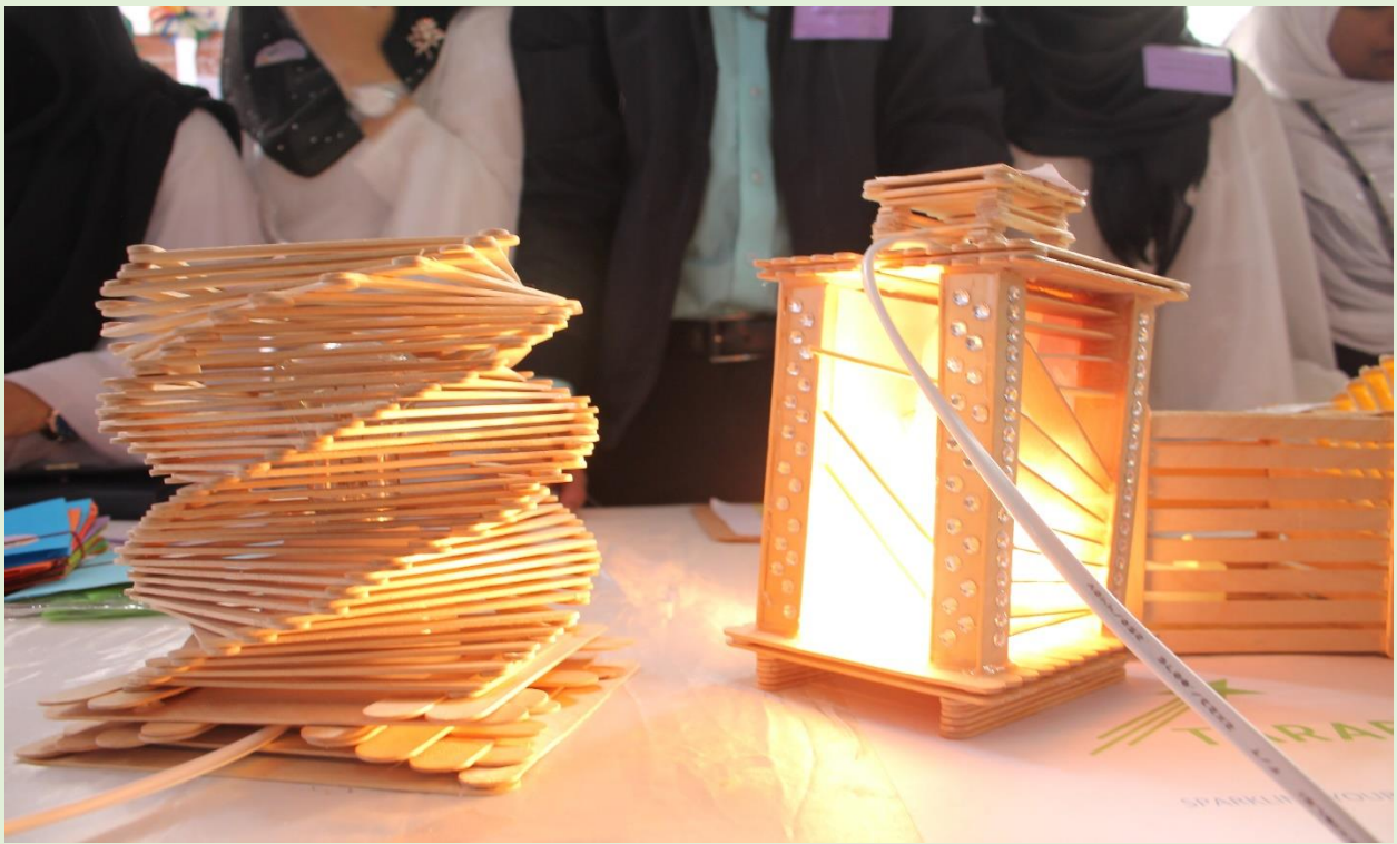
Products presented by students on new product development fest