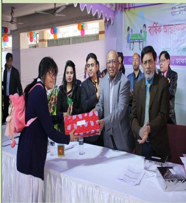
Award Ceremony of Indoor Games Competition