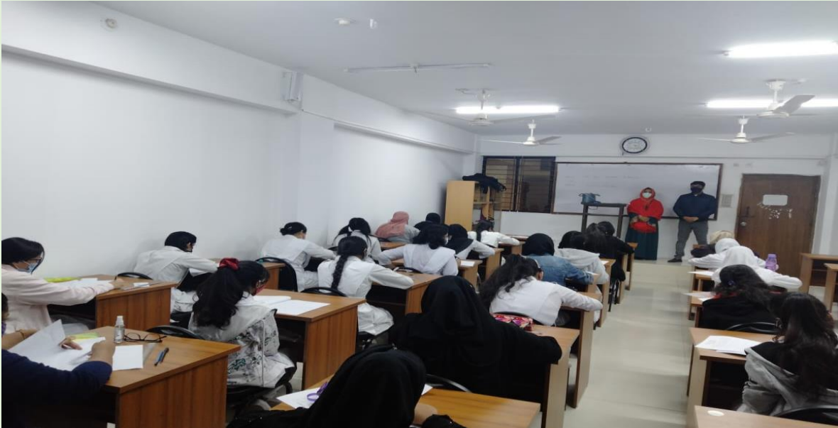
Students attending examination in a room refurbished under IDG project