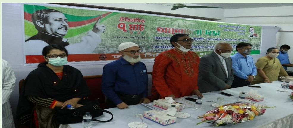
A part of the Governing Body Members on a discussion program of 7 th March, 2021