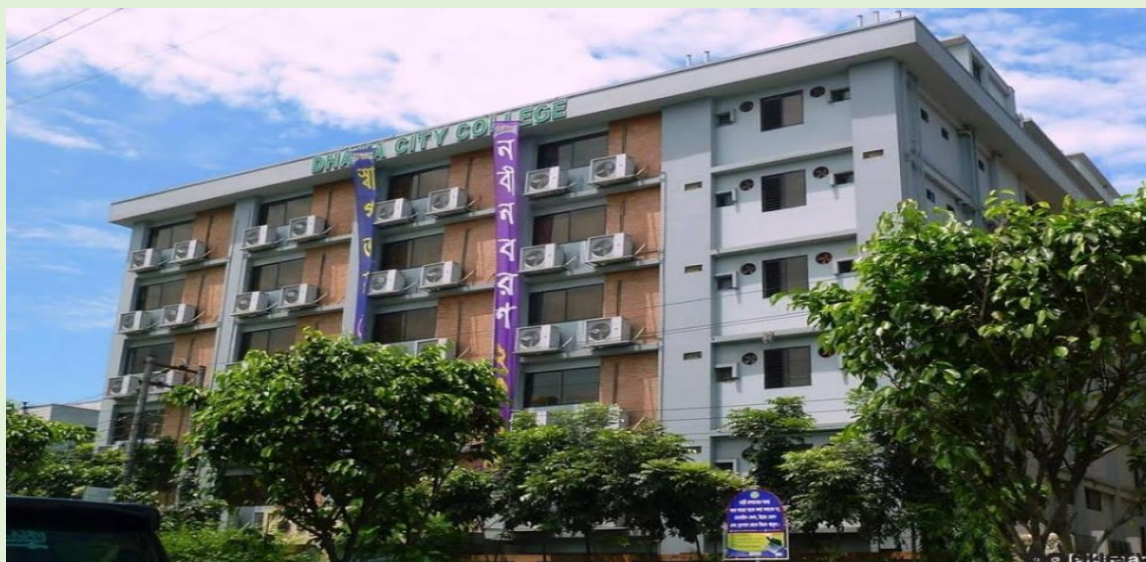
Main College Building at Dhanmondi#02