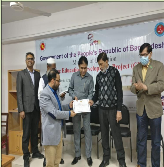
In-house training of teachers and staffs on Basic ICT