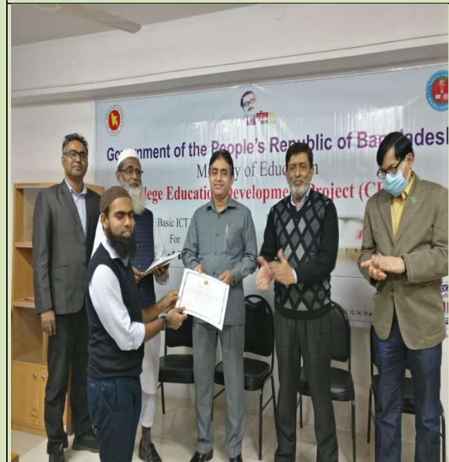
In-house training of teachers and staffs on Basic ICT