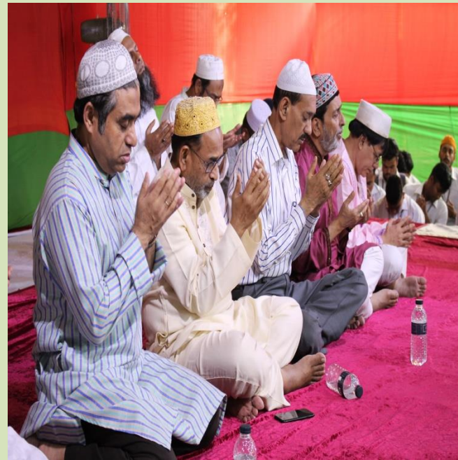
Prayer program for students