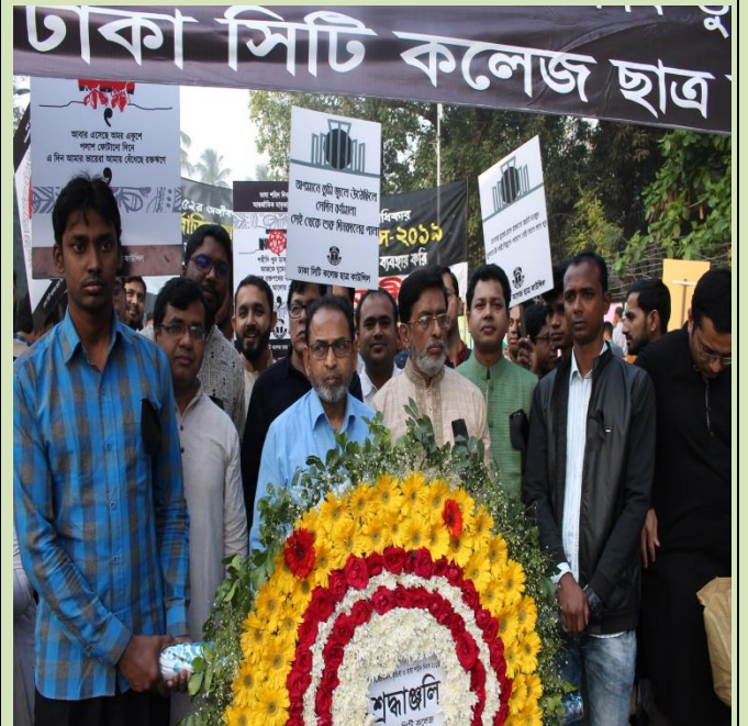
Commemorating national Martyrs' Day