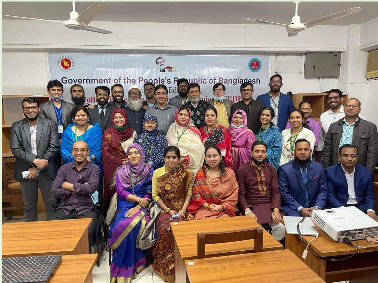
A part of Faculties and Staff on Basic ICT Training