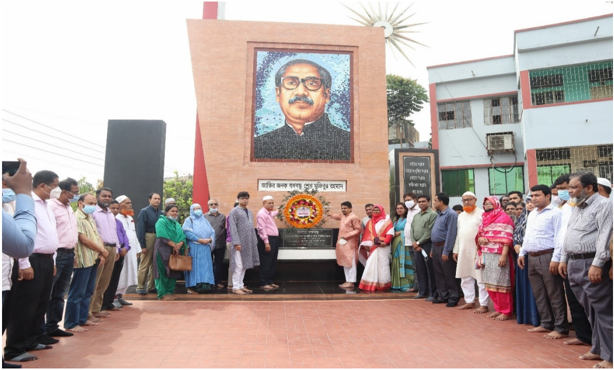
7 th March Speech of Bangabandhu