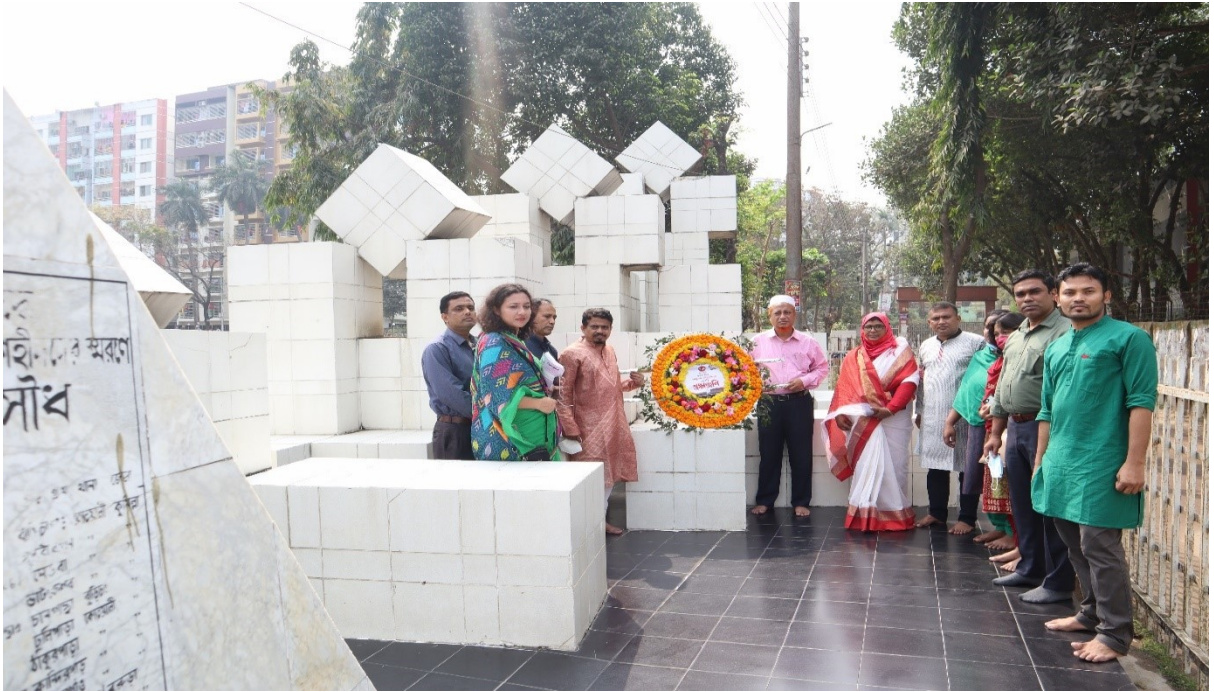
21st February Martyrs Day/ International Mother Language Day