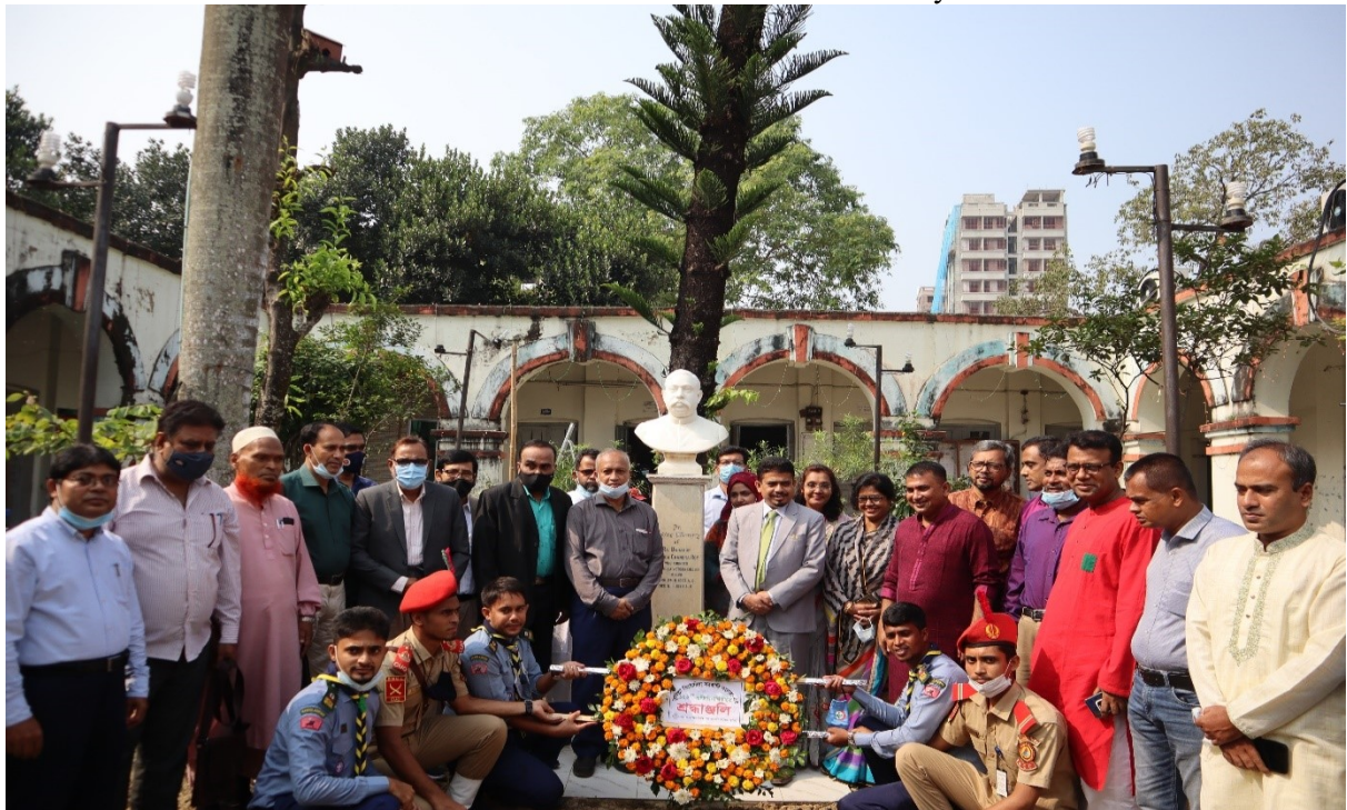
8 th December Cumilla Freedom Day