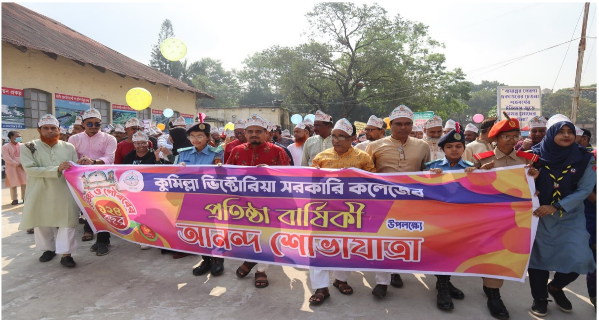
Comilla Victoria Government College Foundation Anniversary Anand Sobhayatra