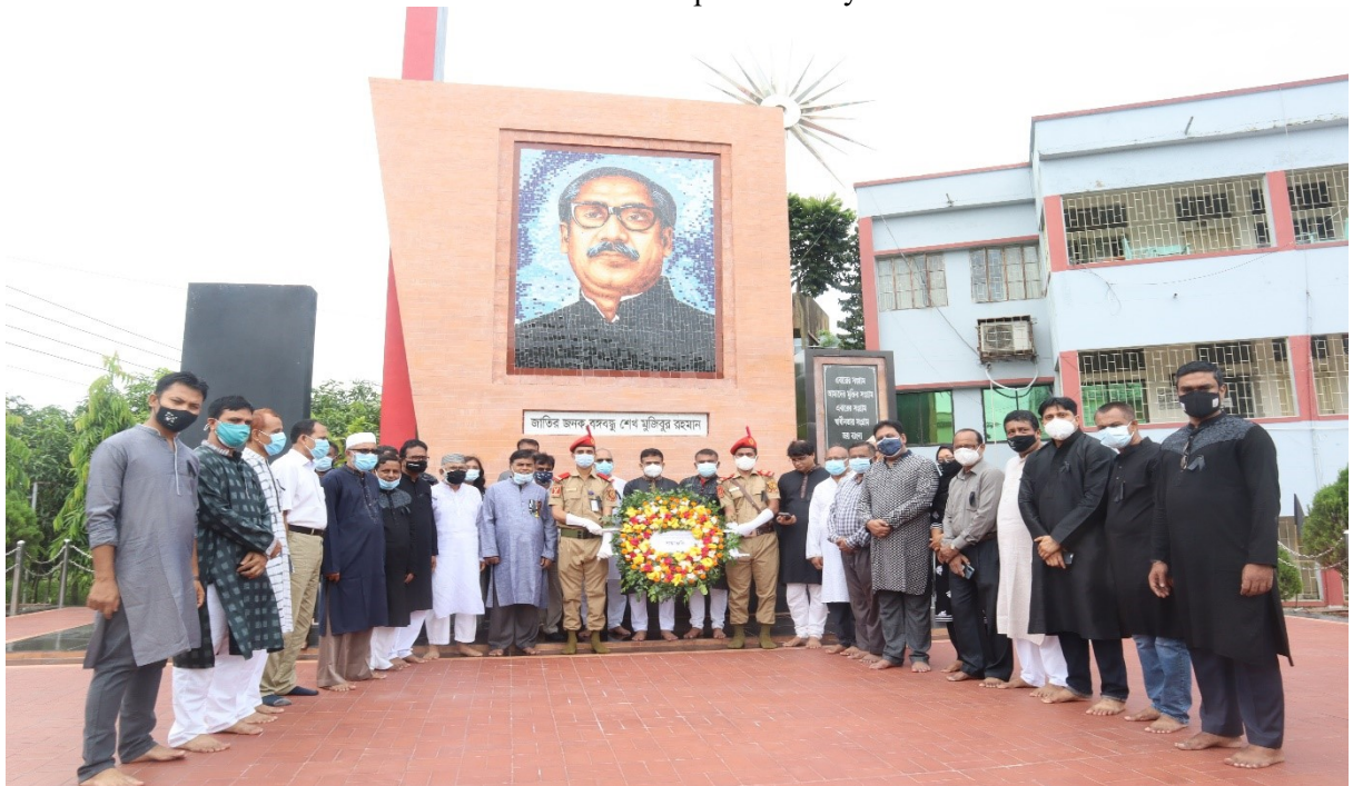
15 th August National Mourning Day