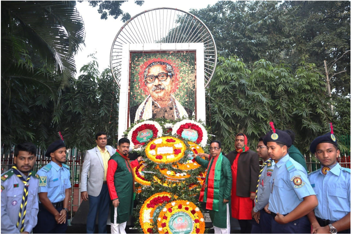
10 th January Bangabandhu Homecoming Day