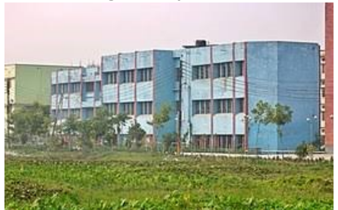
Business Administration Building