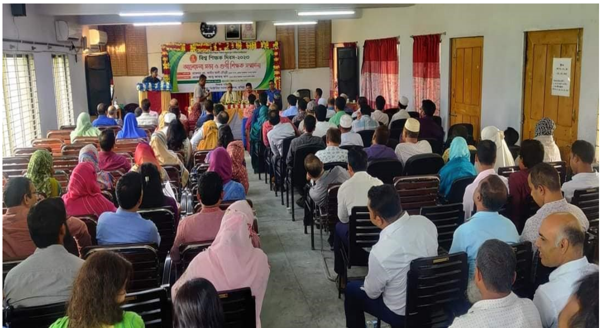
Discussion meeting on World Teachers' Day