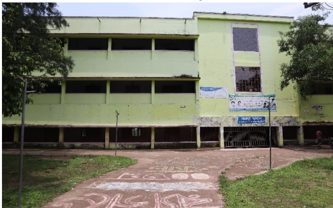
Humanities and Social Science Building