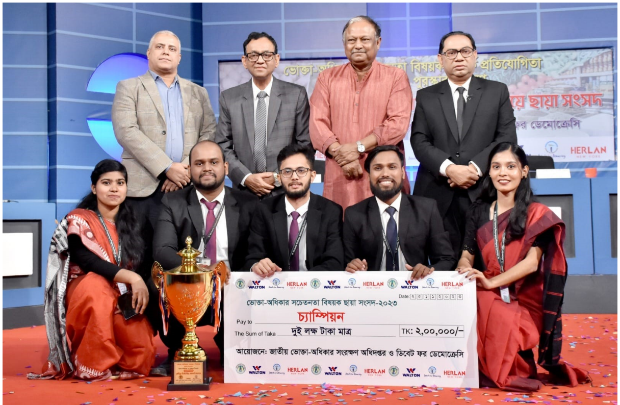
Consumer Rights-Debate on Democracy-VCDS Champion