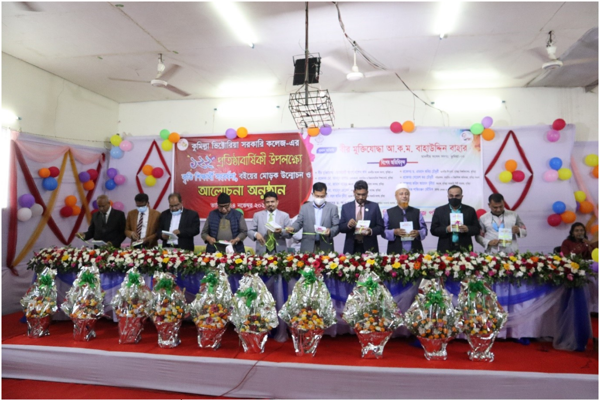
24 th November College Founding Anniversary