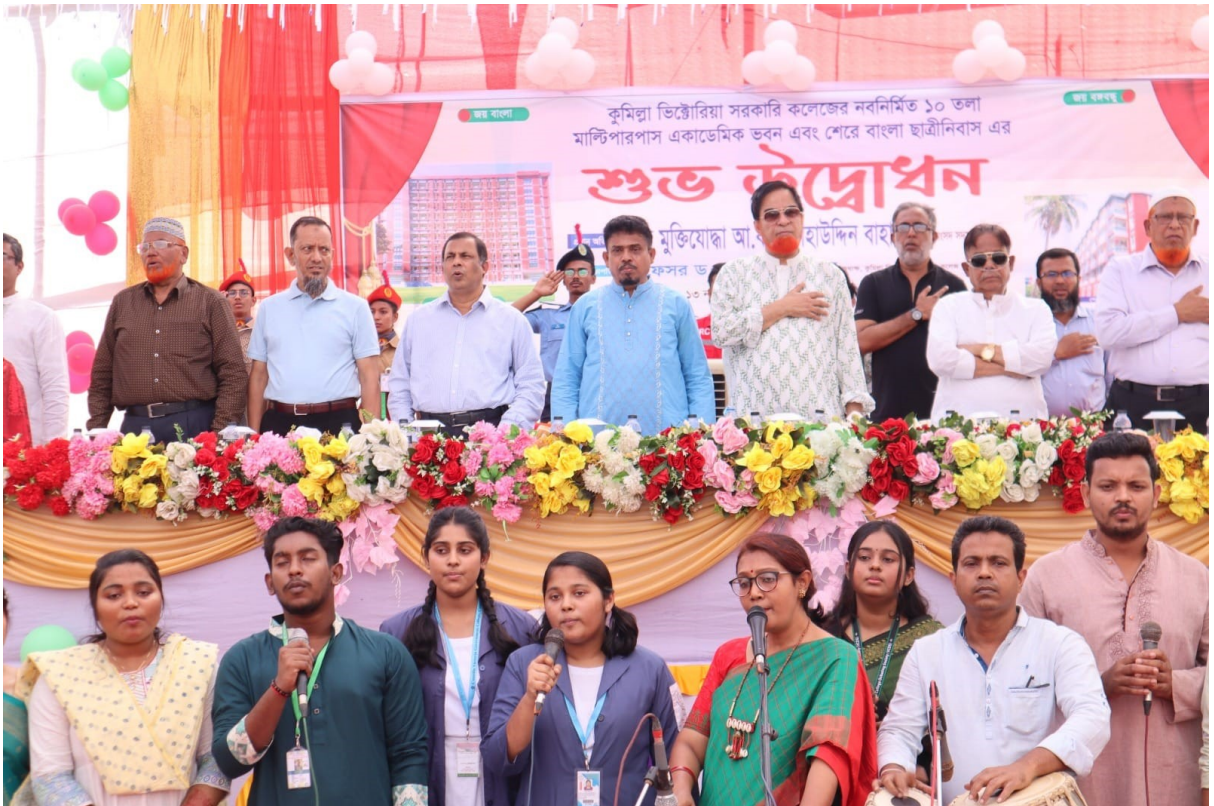
Inauguration of Higher Secondary Multipurpose Building