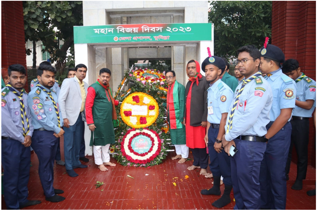
26 th March Independent Day