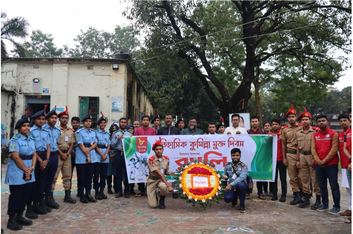
March 8 is the historic Cumilla Independence Day