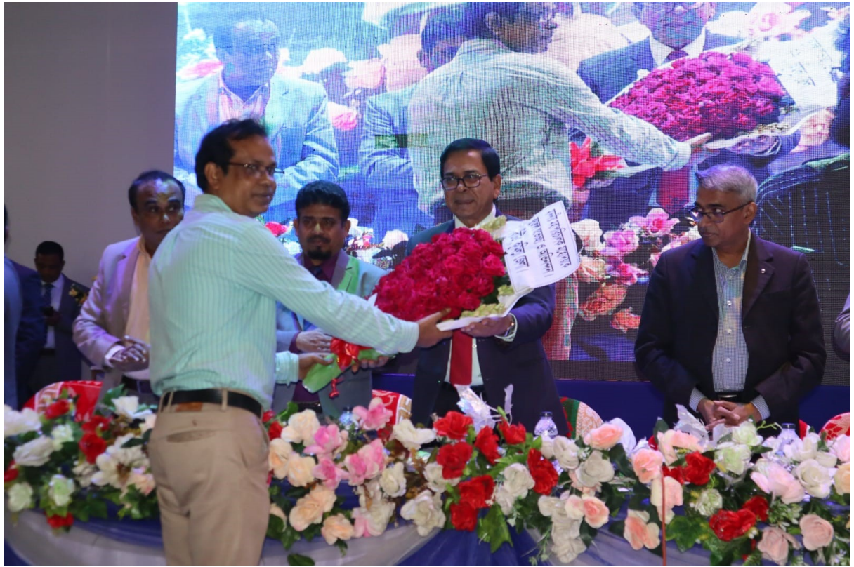
Director General of Directorate of Secondary and Higher Education at the meeting of participants