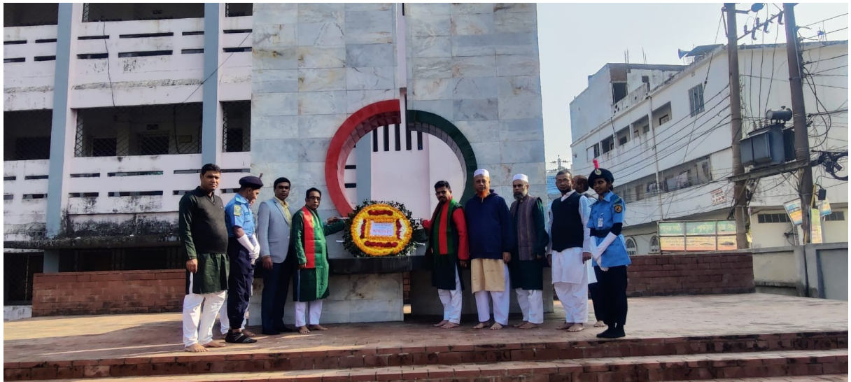
16 December Bangladesh Victory Day