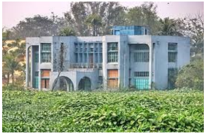
Central Library Building