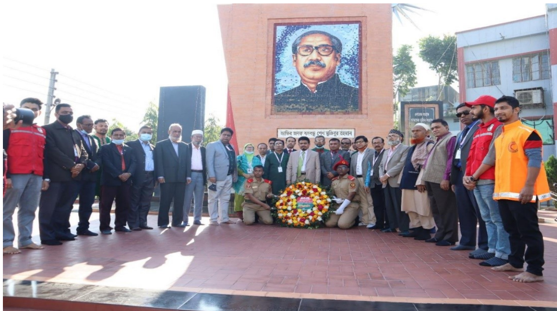
16 th December Victory Day