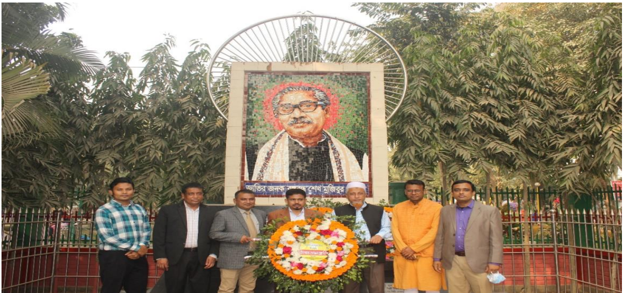
10 th January Bangabandhu Homecoming Day