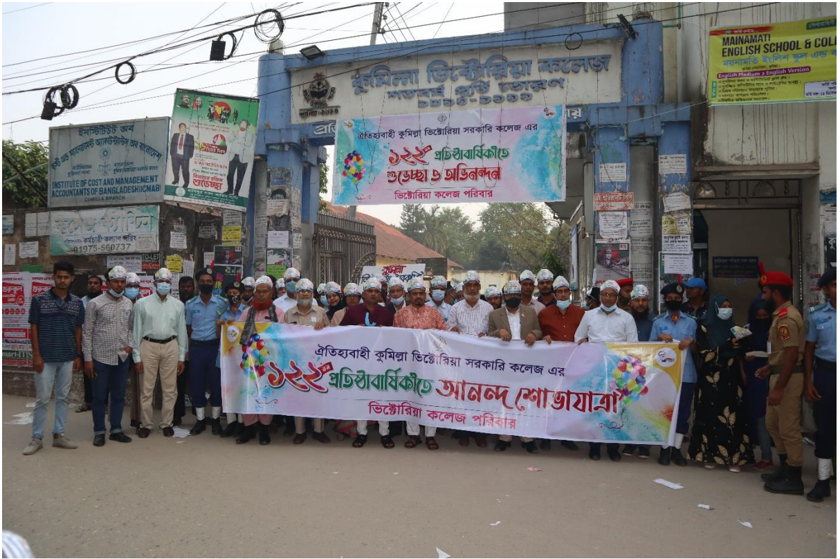
24 th November College Founding Anniversary