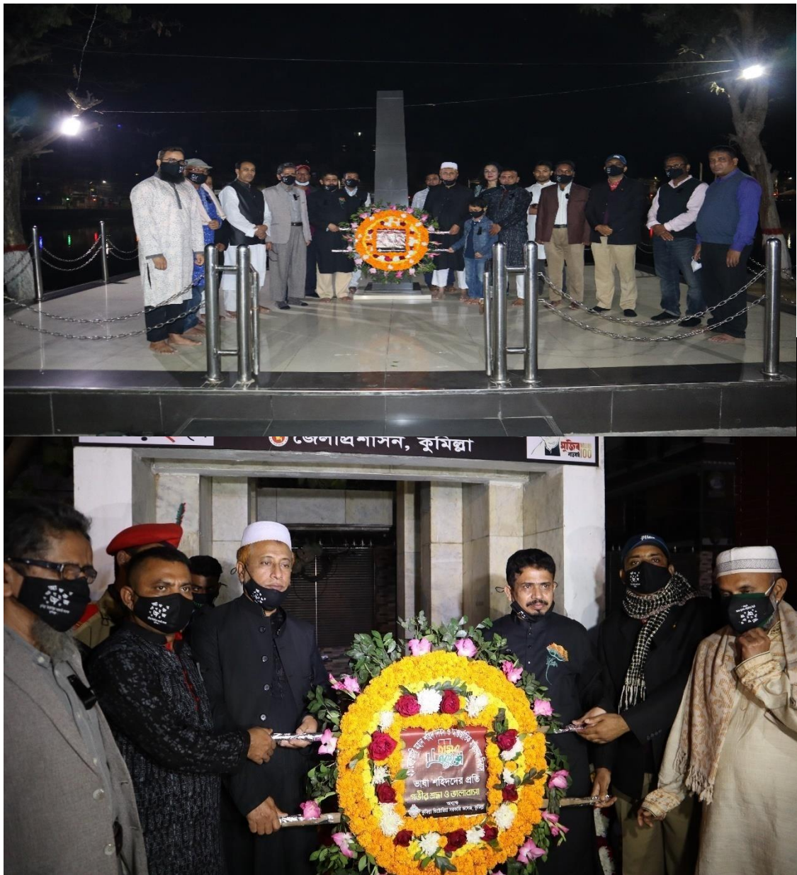
21st February Martyrs Day/ International Mother Language Day