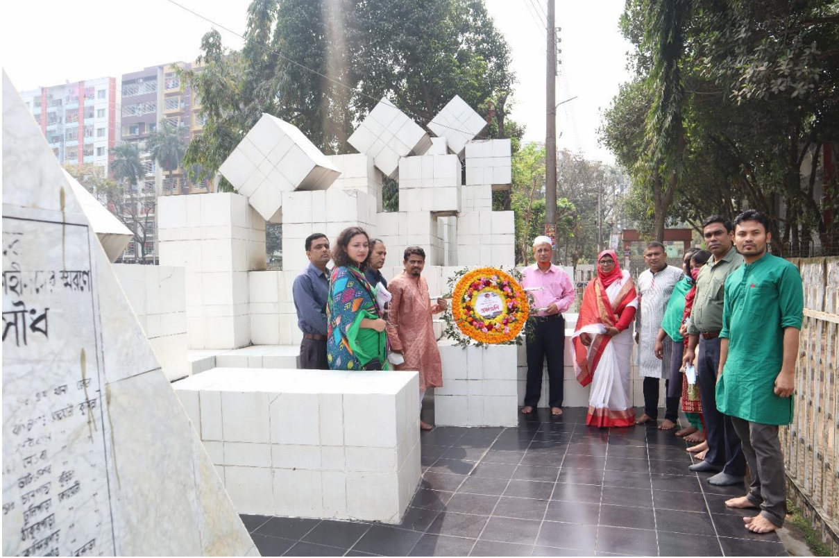
7 th March Speech of Bangabandhu