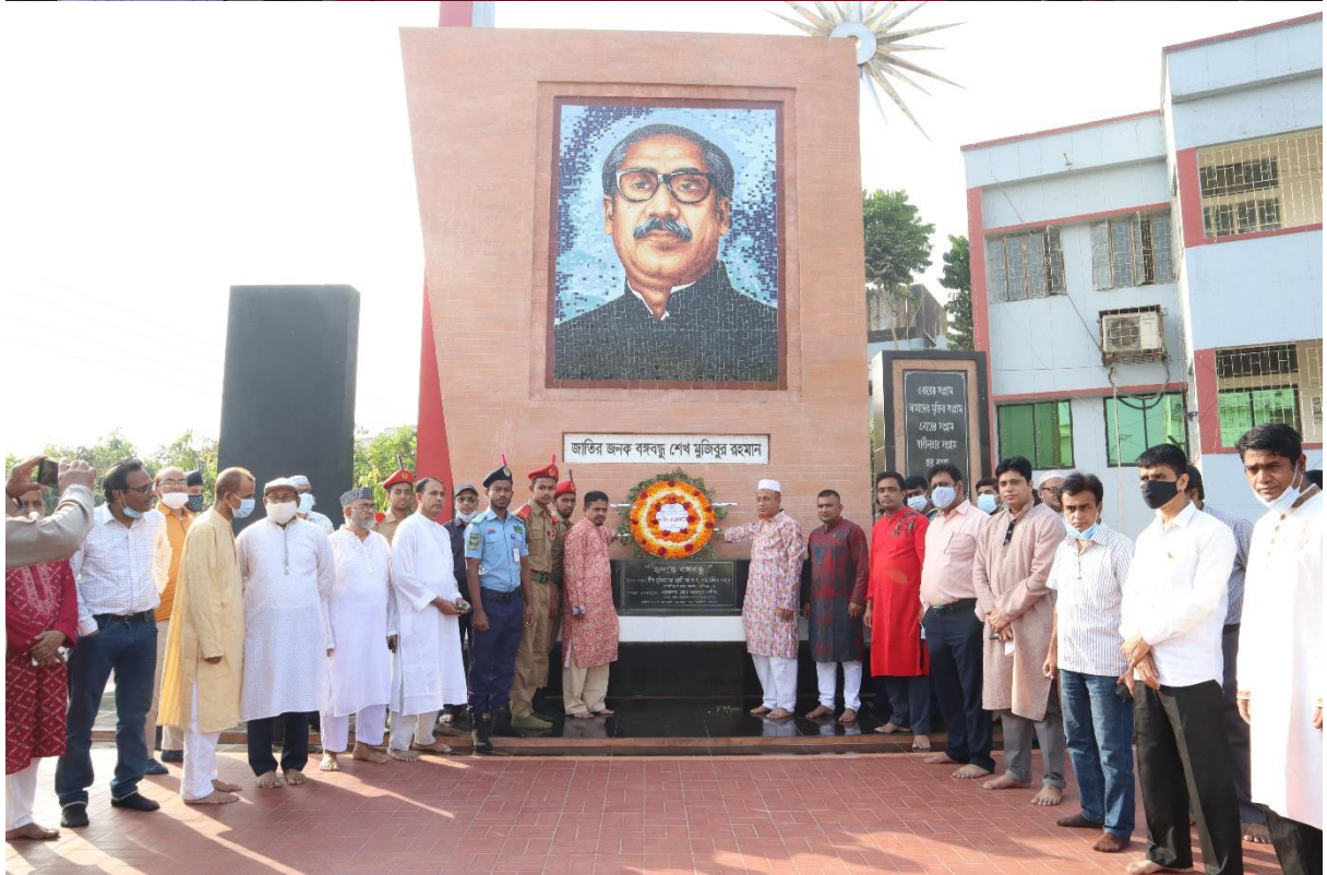
17 th March Father of the Nation's birth anniversary