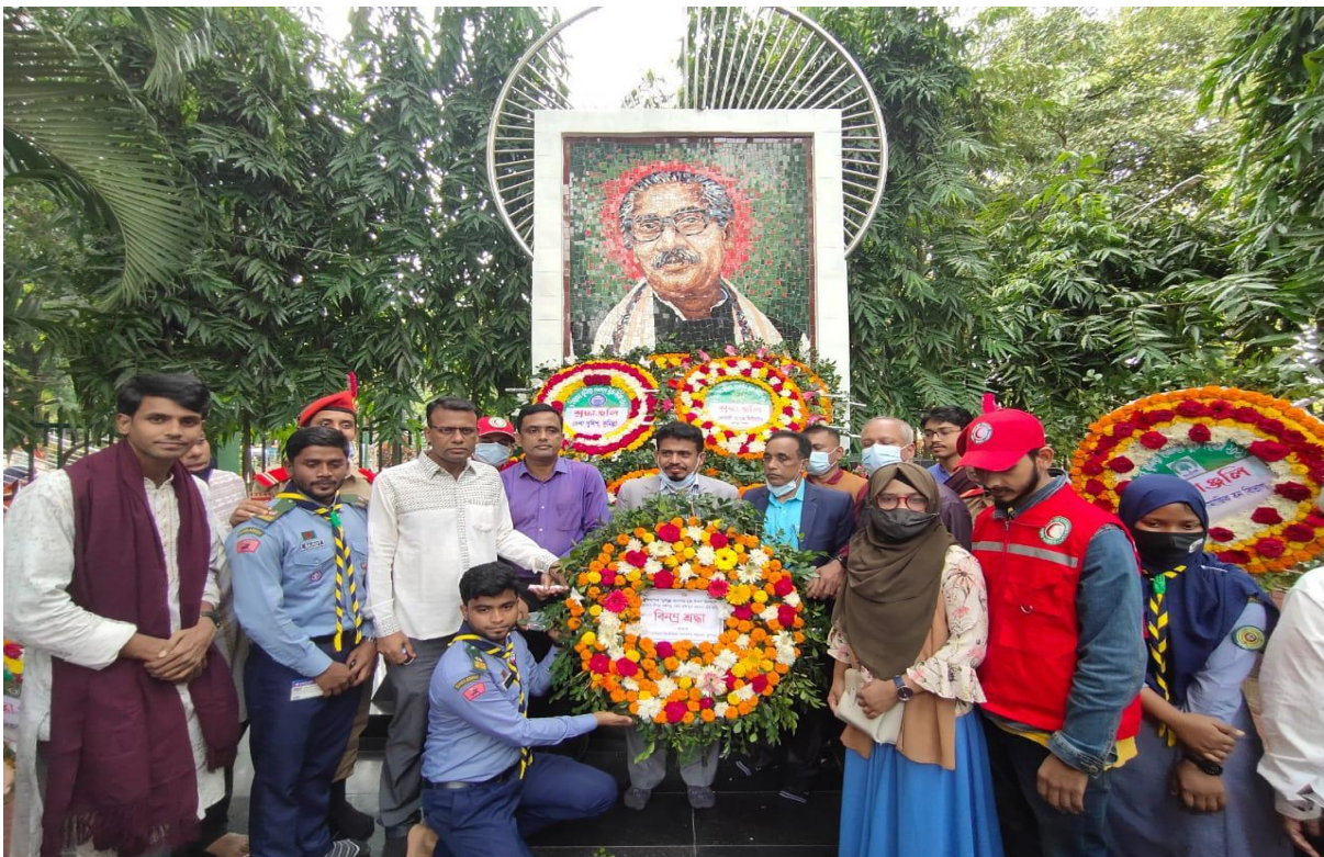
8 th December Cumilla Freedom Day