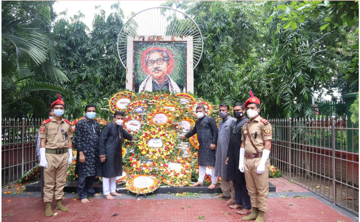
15 th August National Mourning Day