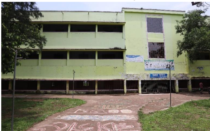
Humanities and Social Science Building