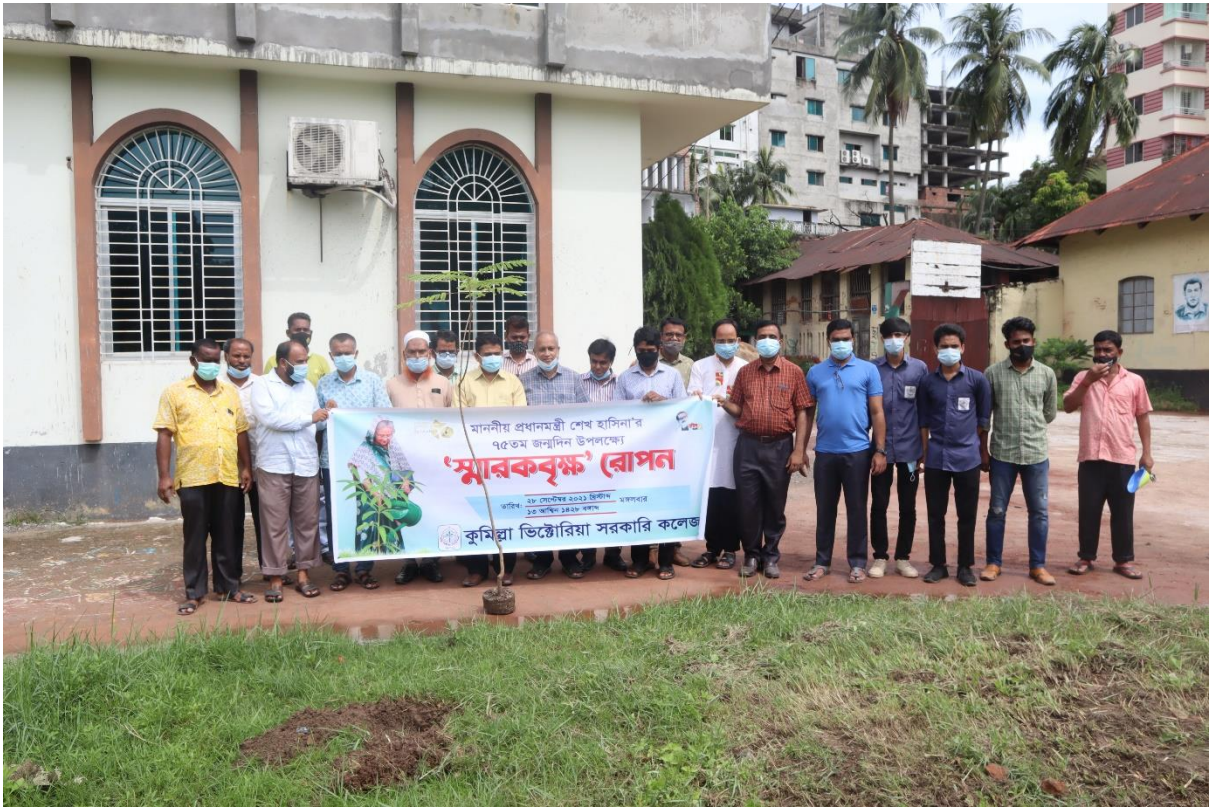
Tree Plantation in PM's Birthday