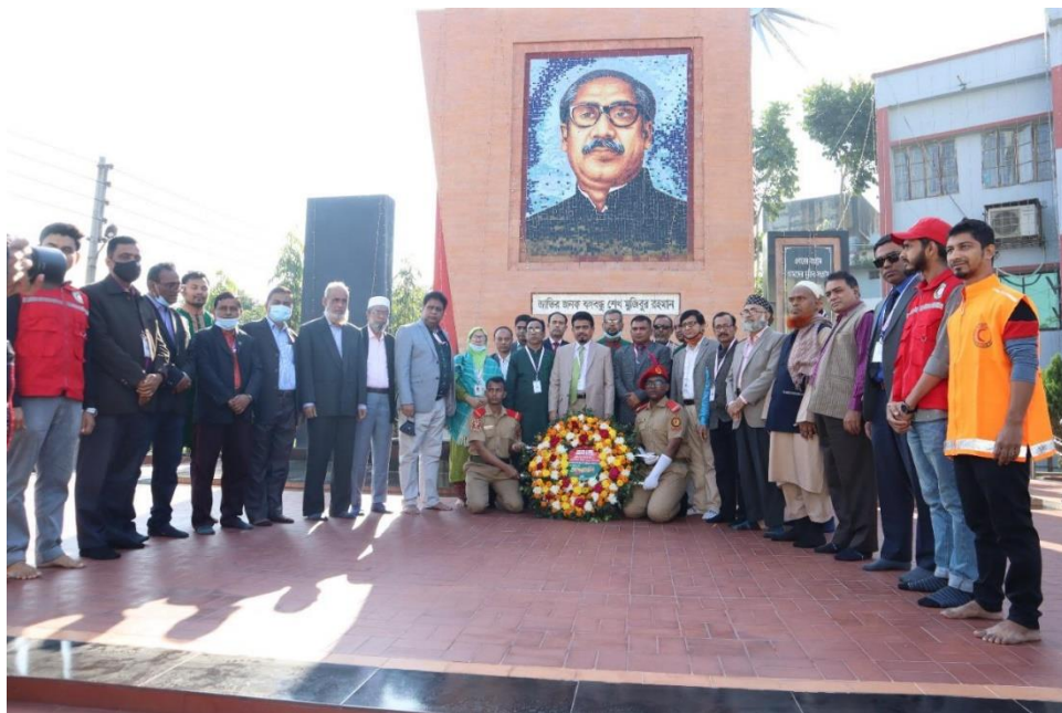
16 th December Victory Day