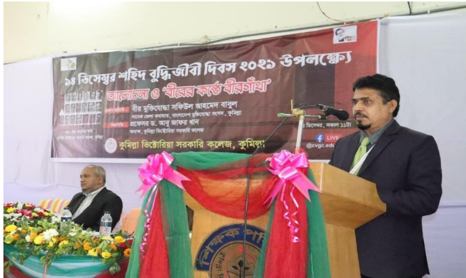
14 th December Martyred Intellectuals Day