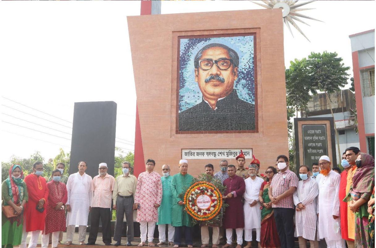
26 th March Independent Day